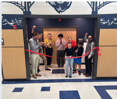
Students and staff celebrate the completion of the restroom remodel at Newport Middle School!