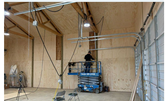
The new Forestry Program building at Waldport High School is now complete.