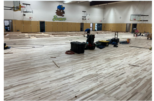
New flooring installation at the Toledo Elementary gym.