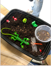
Growing microgreens are a great way to garden indoors

We are hitting that cold, dark time of the year again. For the outdoor garden space this is a time for dormancy and planning for the spring. Some crops like kale will be harvested all winter and many of the hydroponic crops are at full production. There are things that students can grow at home that can add cheer to our short winter days. The families that came to Yaquina View's Winter Festival had the opportunity to take home microgreen growing kits, also known as the world's smallest gardens.