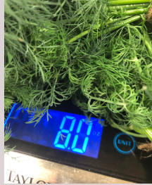
Half a pound of hydro-dill was harvested from Ms. Sanders' classroom tower at Sam Case

Students in Newport have been harvesting produce from both the outside gardens and the indoor hydroponic towers to use in their school lunches. We are thankful for the hard work our students, teachers, and kitchen staff are putting in to add fresh, nutritious, colorful and tasty school grown foods into our meals. The students carefully weigh the produce going into the kitchens so that we can track our progress.