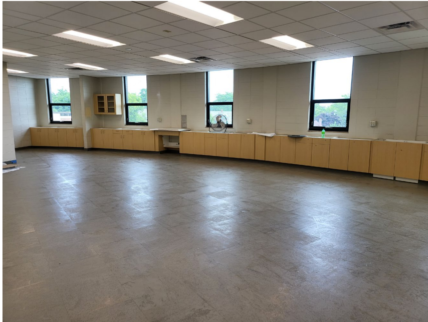
New casework installed in classroom