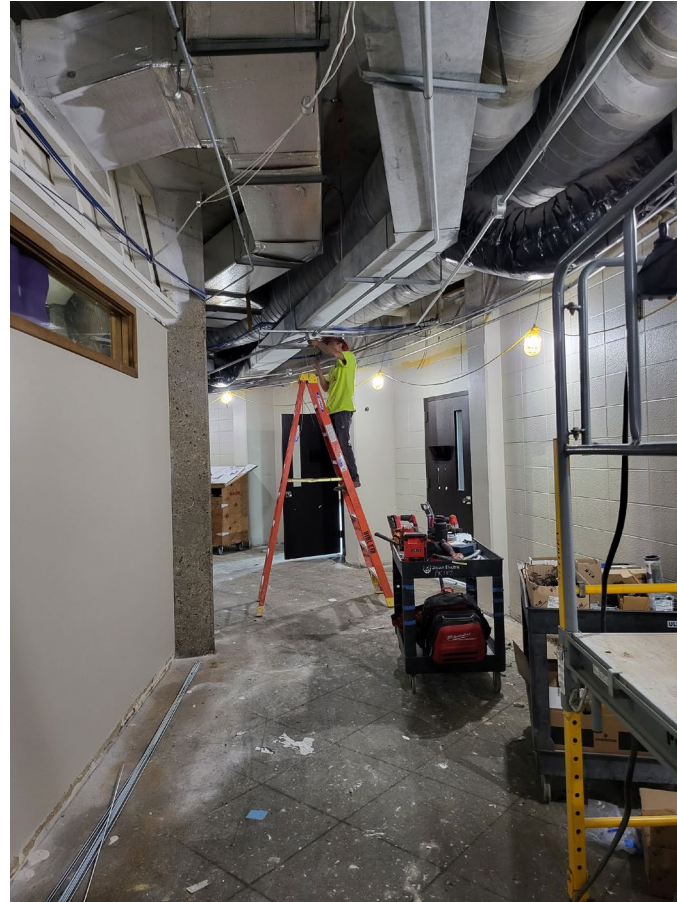
Ductwork improvement throughout corridors