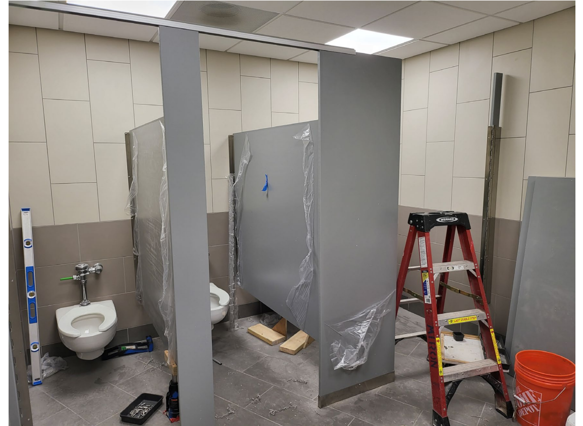
Renovated restrooms nearing completion