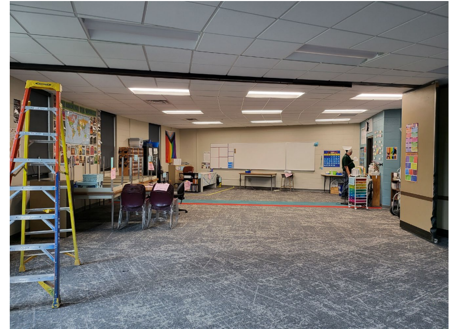
Renovated classroom with wall dividers