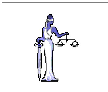
Lady Justice with her double-edged sword depicting the power of Reason and Justice.

Now more than ever, we need to maintain and grow CCJEF's membership to intensify the pressure on state policymakers over the coming months.