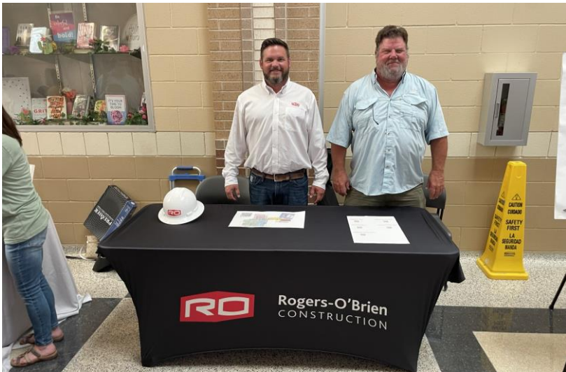
2023 Fun Fest