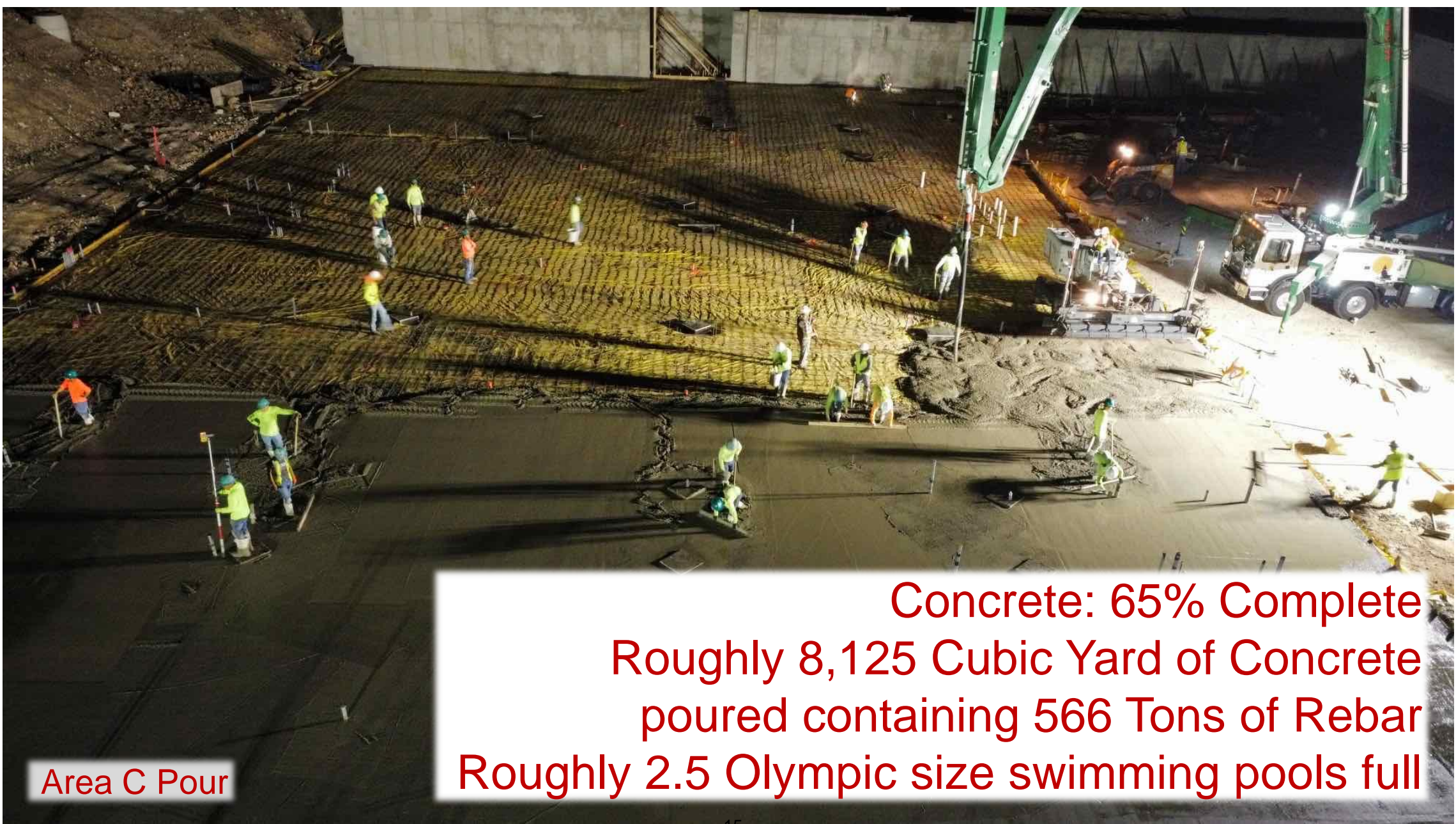
Area C Pour

Concrete: 65% Complete Roughly 8,125 Cubic Yard of Concrete poured containing 566 Tons of Rebar Roughly 2.5 Olympic size swimming pools full