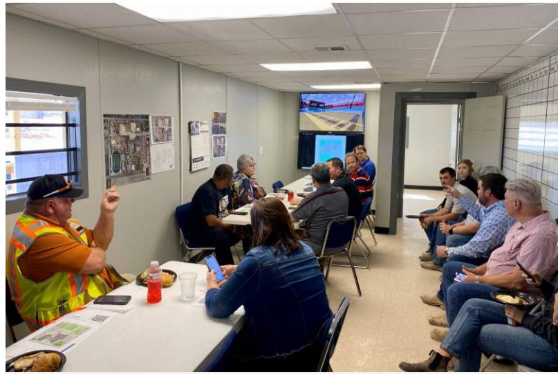
WISD Maintenance BIM Coordination