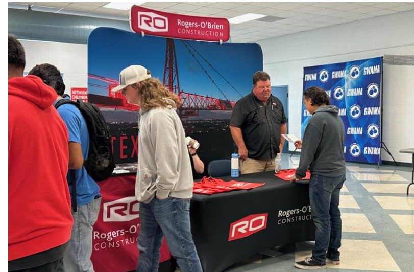
GWAMA College & Career Fair