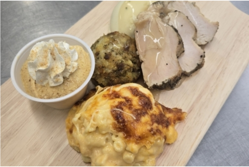
Thanksgiving Meal – Herb Brined Roasted Turkey Breast, Dressing, Baked Mac and Cheese, Yukon Gold Mashed Potatoes with Pan Gravy and Pumpkin Pudding Parfait