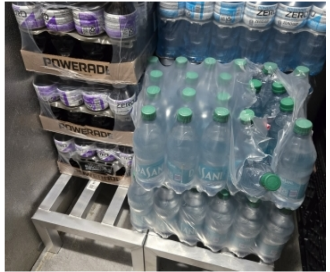
New Storage Dunnage Racks