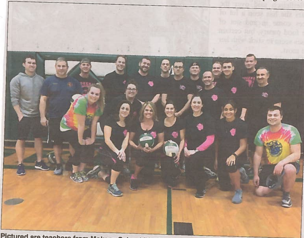
Pictured are teachers from Mokena School District 159 and members of Mokena Fire Protection District and Mokena Police at their sixth annual Volley for a Cure event. Together, they were able to raise $2,045 for the Mokena Cancer Support Center.

of the T-shirts, $2,045 was raised. What a great night for the community to get together for a great cause. (School staff won 2 out of 3 games... but who is keeping score?!?)