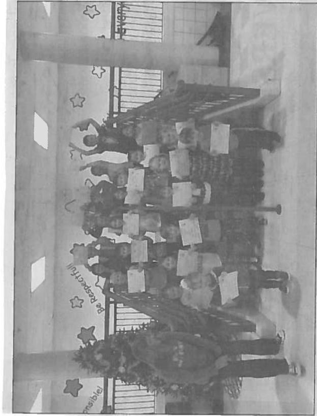
The December winners in kindergarten through second grade are shown.