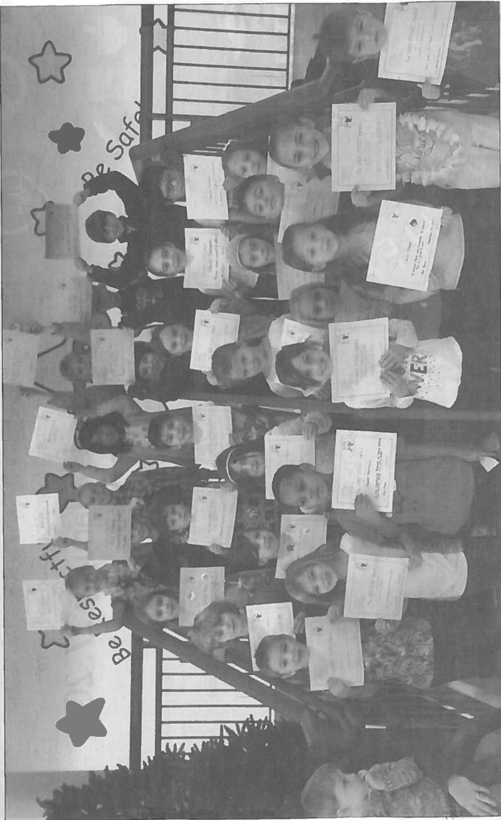
Mokena Elementary's November Star Award winners, who are in kindergarten through third grade, are pictured.

MES teachers choose students who best exemplify school motto to 'Be Responsible, Be Respectful, Be Safe'