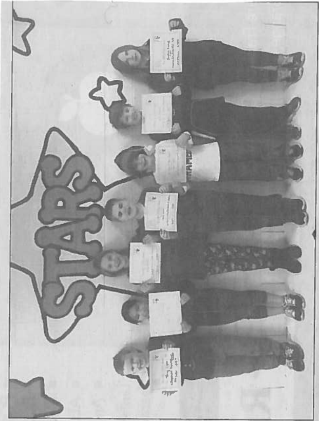
December's third-grade award winners gather for a photo.