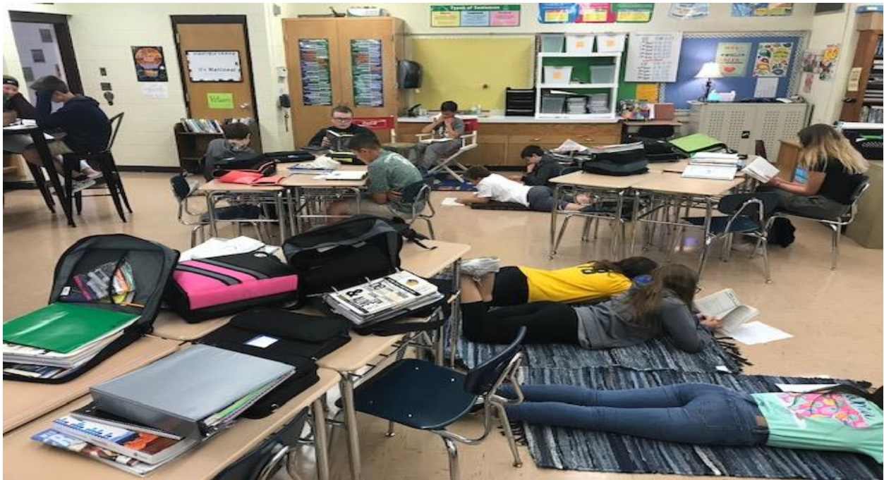
Students in Mrs. Ibarra's Reading class using the flexible seating options to read!