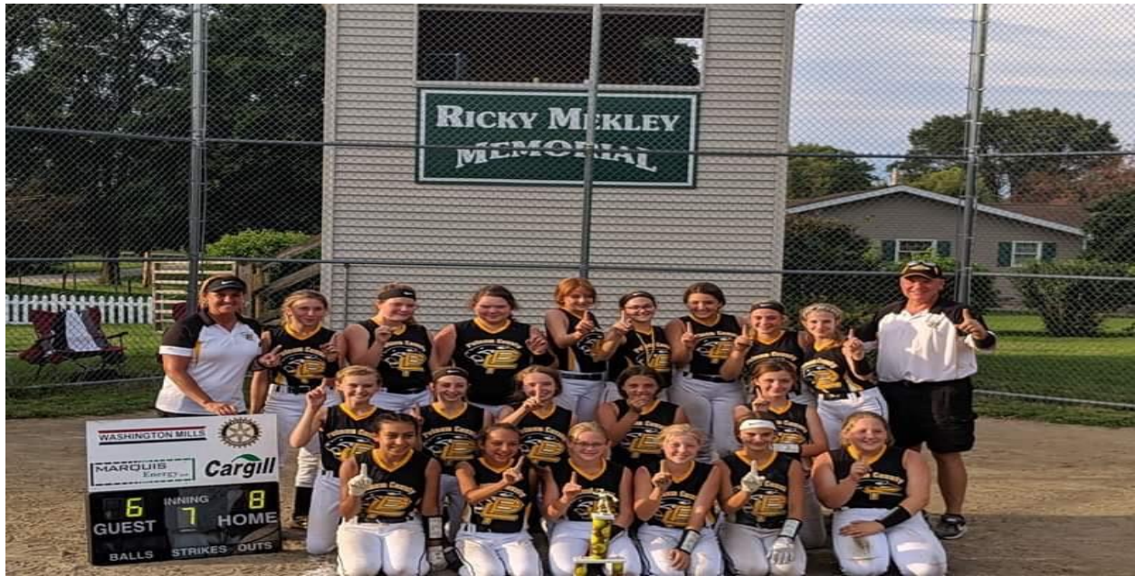
Our Lady Puma Classic Champions!