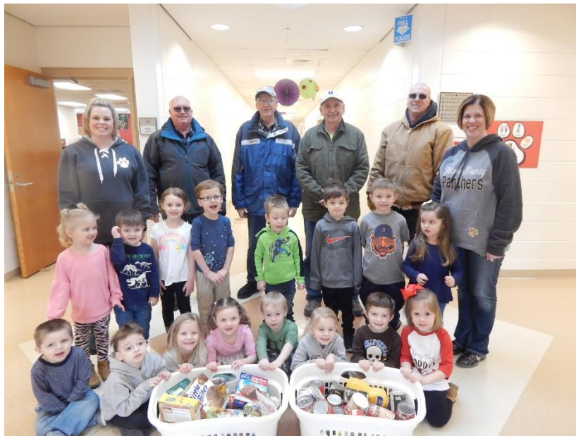
PreK-2 nd Grade Collected 646 items for the Food Pantry this year!!!