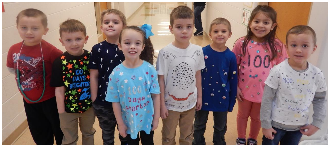
Kindergarteners wearing 100 items....and SOME were edible! :-D