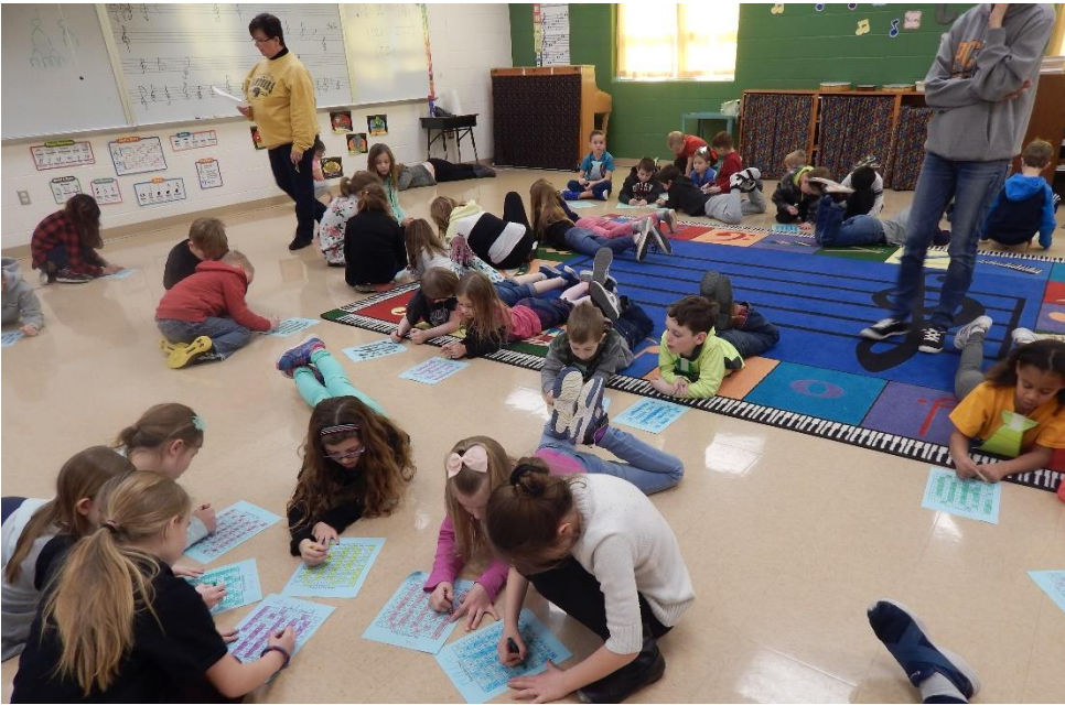
2 nd Grade works on a 100 mystery “follow the clues” activity.