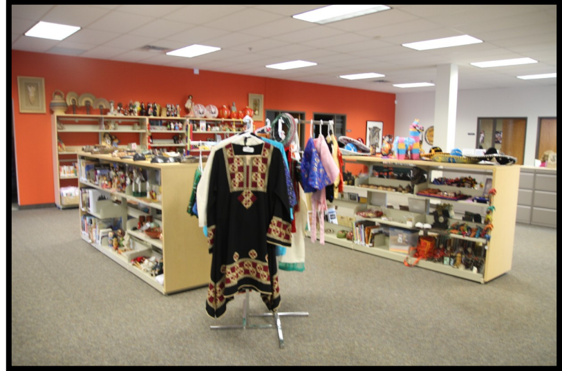
Multicultural Resource Center located at NWSISD