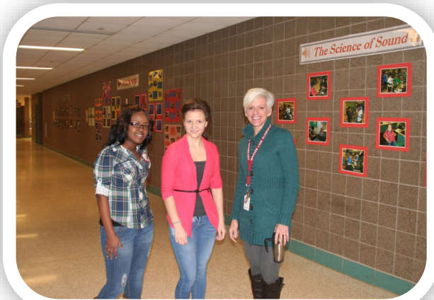
The Educators Rising program provides opportunity for students to shadow educators for a day