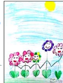
Maya Losardo, Age 8

To give you a broader picture of how Ladders to Literacy works, as well as specific tools used, following are a number of excerpts and sample activities taken from Ladders to Literacy: A Preschool Activity Book .