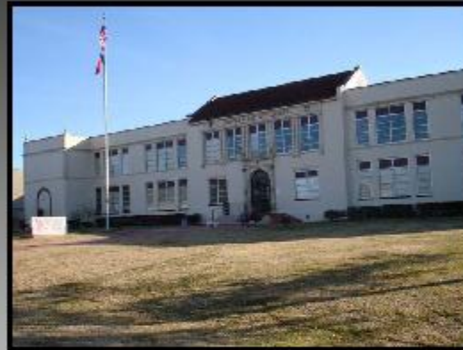
Robert E. Lee High School