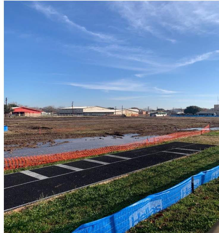
Stadium Improvements Project- Water Injection Work