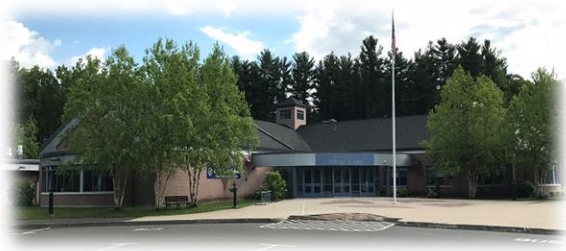
Kelly Lane Primary School Grades PK-2 Enrollment: 371