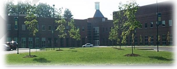
Granby Memorial High School Grades 9-12 Enrollment: 569