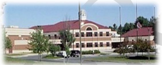
Granby Memorial Middle School Grades 6-8 Enrollment: 446