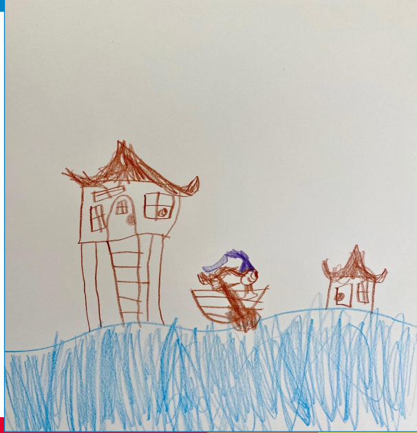
Owen C. Northport Elementary