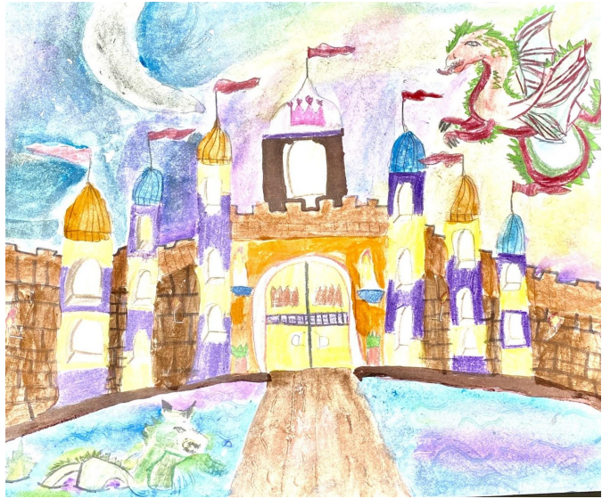
Leslye V.R. Neill Elementary