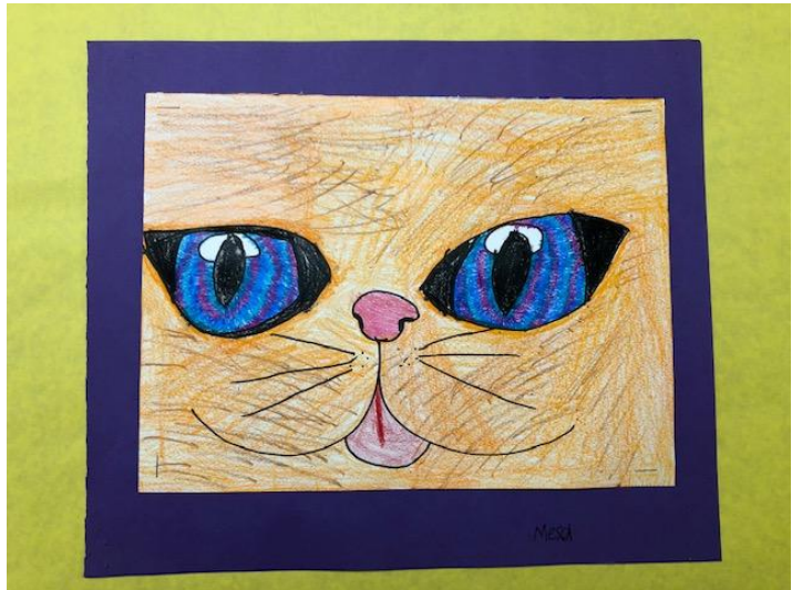
Mesa V. Neill Elementary