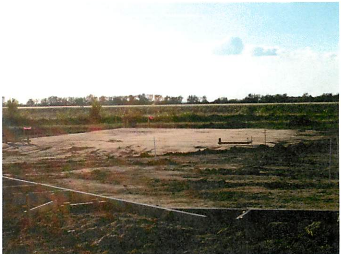
4. Concrete formwork for concession building