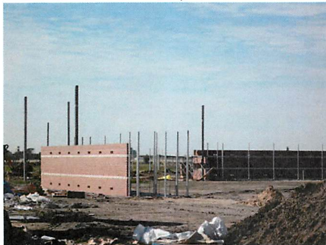
5. Dugout construction at field # 4