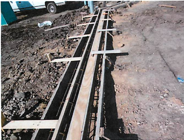
1. Trench drain / backstop foundation field # 6