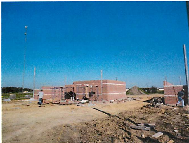
3. Flex-field restroom exterior partitions.