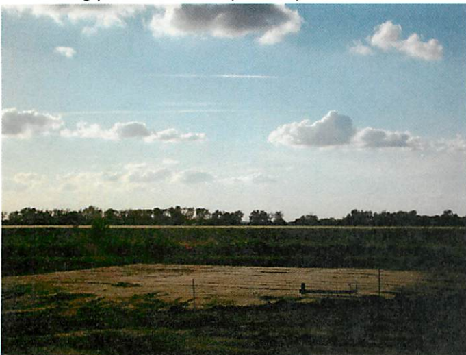
5. Building pad for softball batting cages