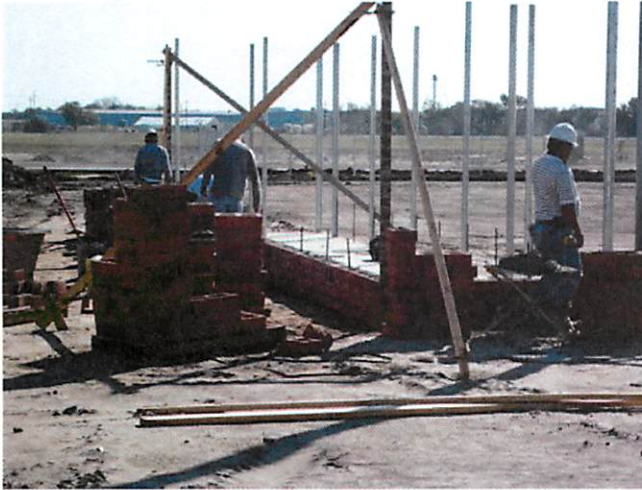
9. Dugout construction at field # 3