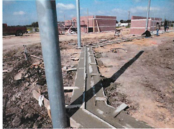
10. Concrete pour at backstop foundation / Trench drain