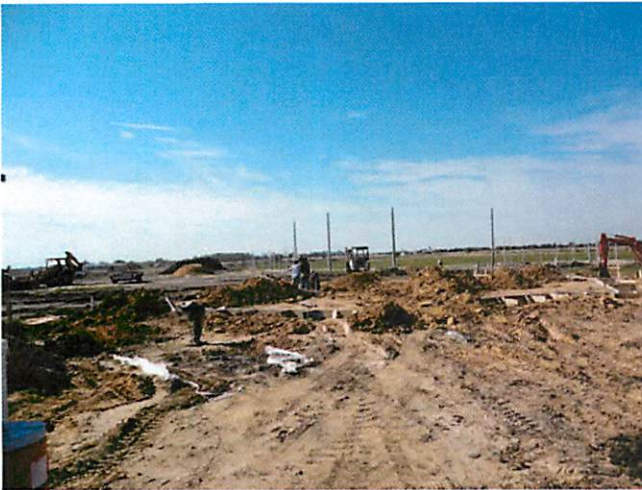
7. Underground electrical at concession restroom bldg.