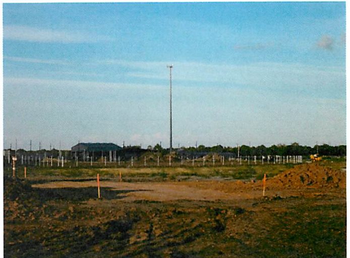
2. Building pad for 3 rd base dug-out (Baseball)