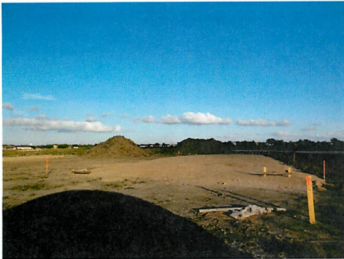
1. Building pad for baseball batting cages