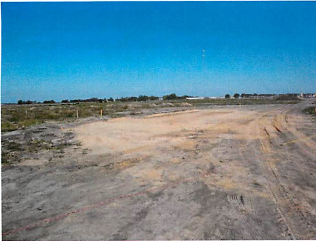
1. Building pad at softball field dugouts