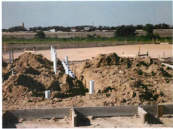
2. Underground plumbing at concession restroom bldg.