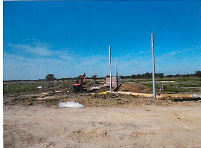
4. Backstop concrete formwork field # 5