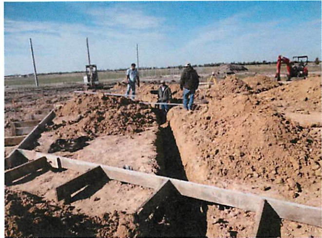
8. Underground electrical at concession restroom bldg.