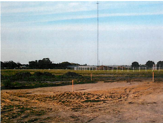
3. Building pad for 1 st base (Softball)