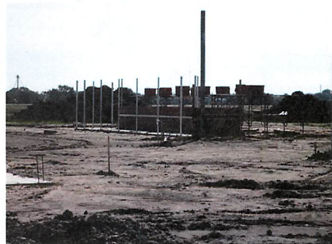
6. Dugout construction at field # 3