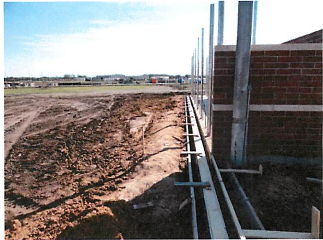
2. Trench drain / backstop foundation field # 6