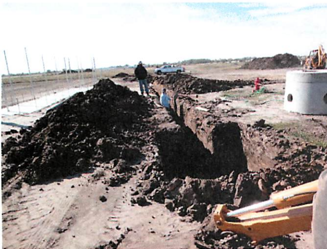
11. Storm sewer system installation