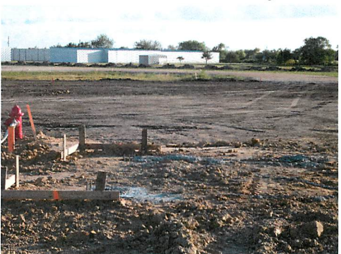
6. Concrete piers at front entry pavilion