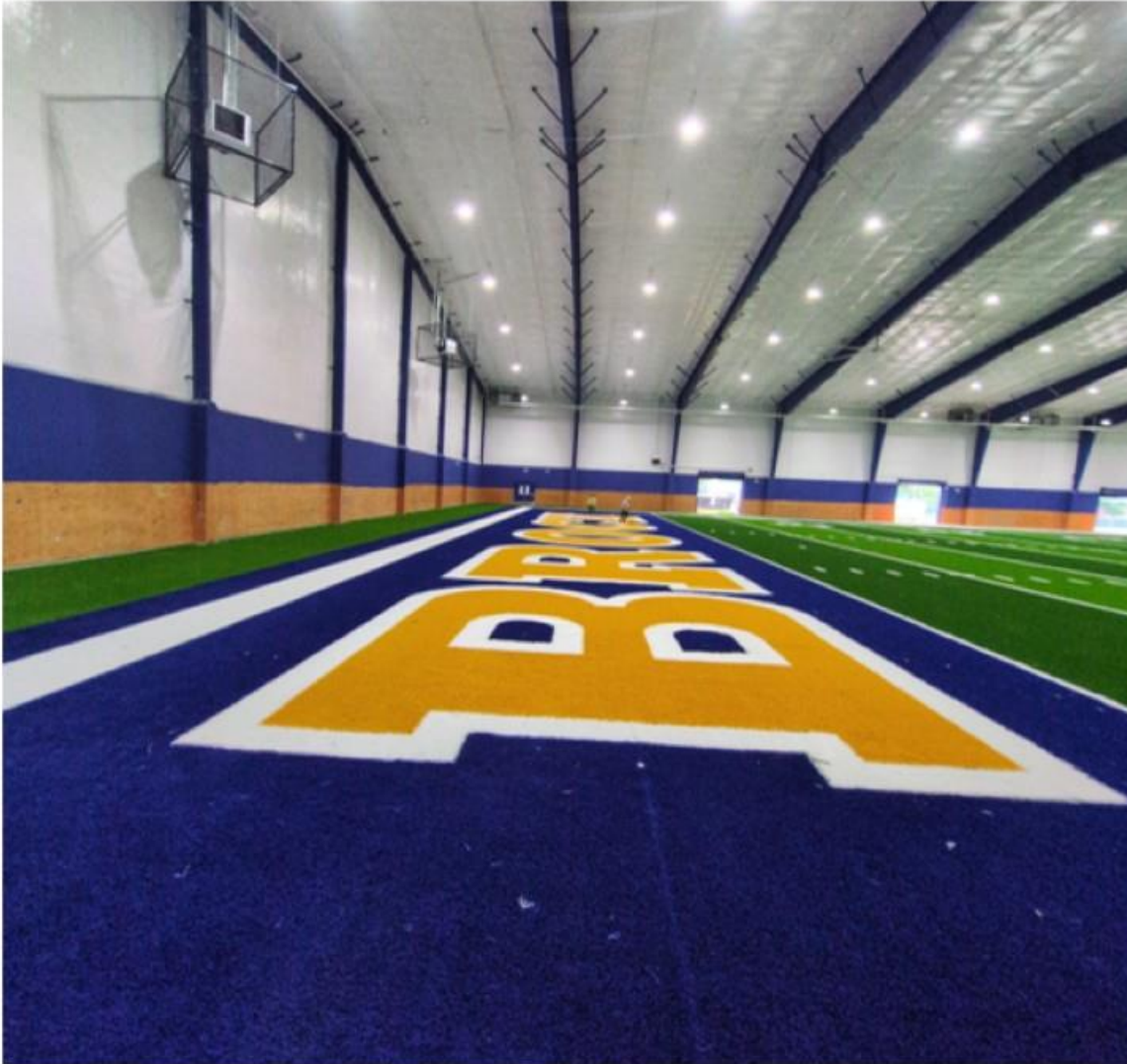
Practice Field Area Progress