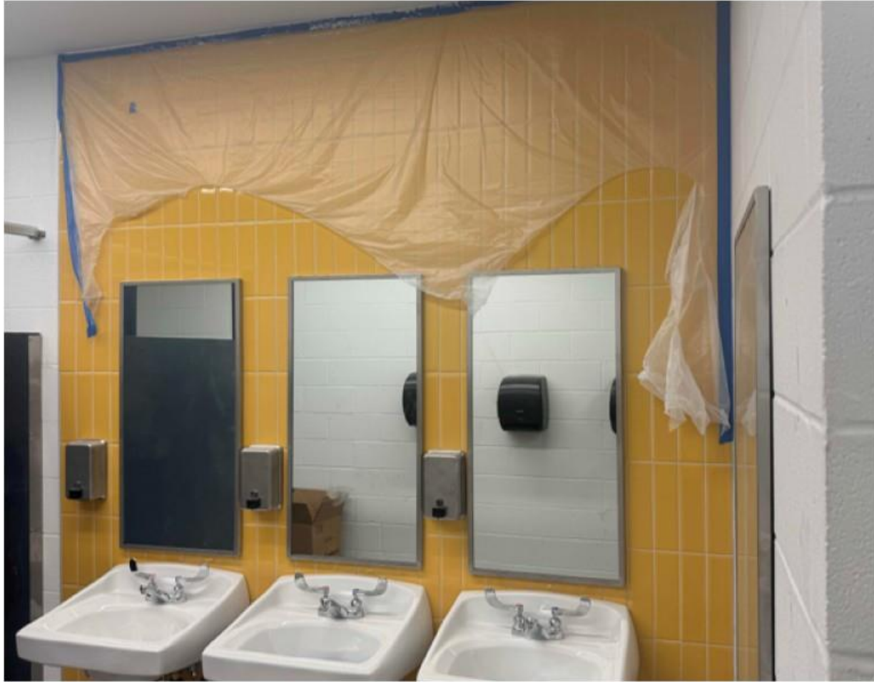
Plumbing Fixtures and Accessories in Restrooms