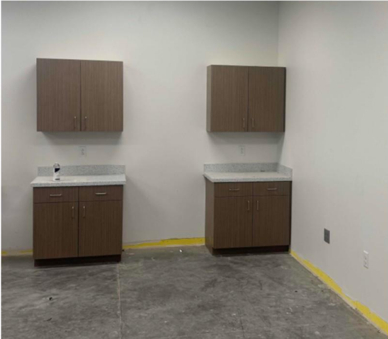
Cabinets in Training Room Installed