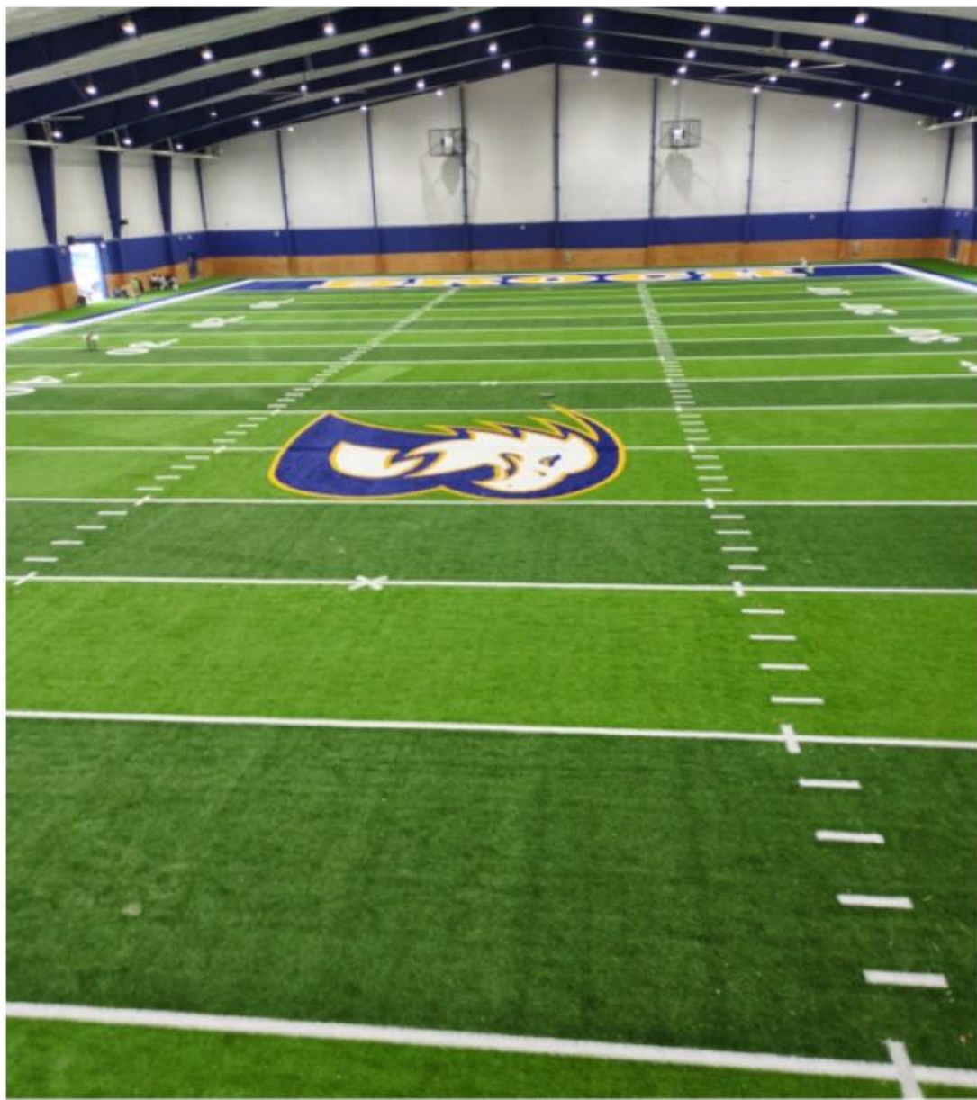
Practice Field Area Progress