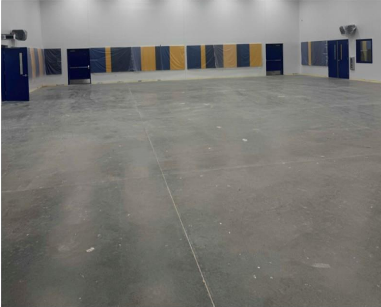
Band Hall Work Progress