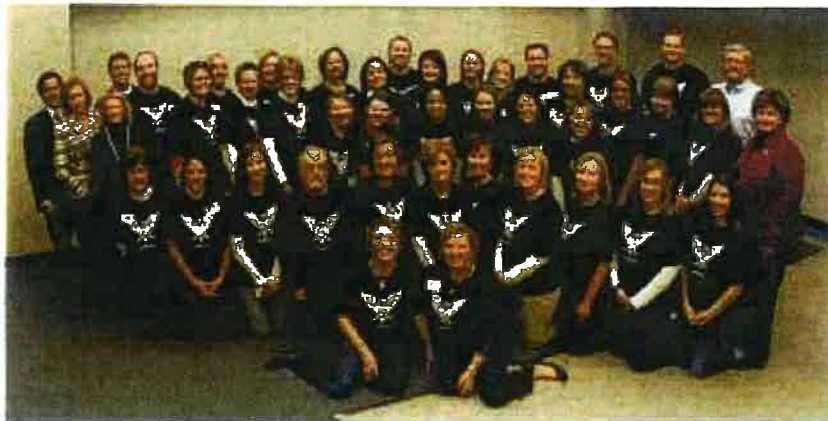
Birdville ISD was the inaugural class in the first-ever Ambassador Training Academy.