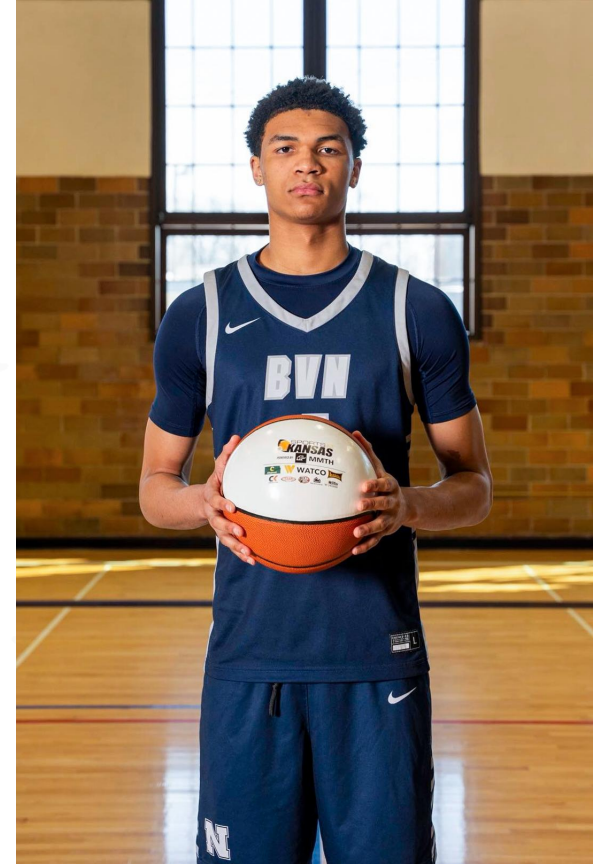
Sports in Kansas