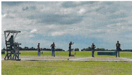
Shooting Picture 2.jpg 2248K