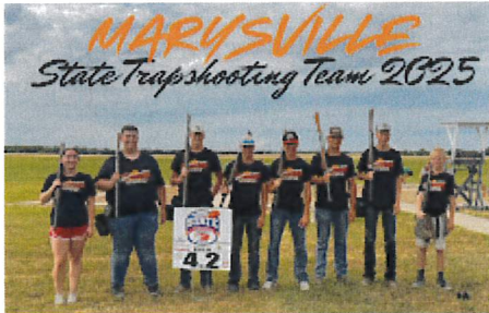
Team Picture.PNG 814K