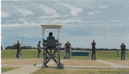
Shooting Picture.jpg 1587K