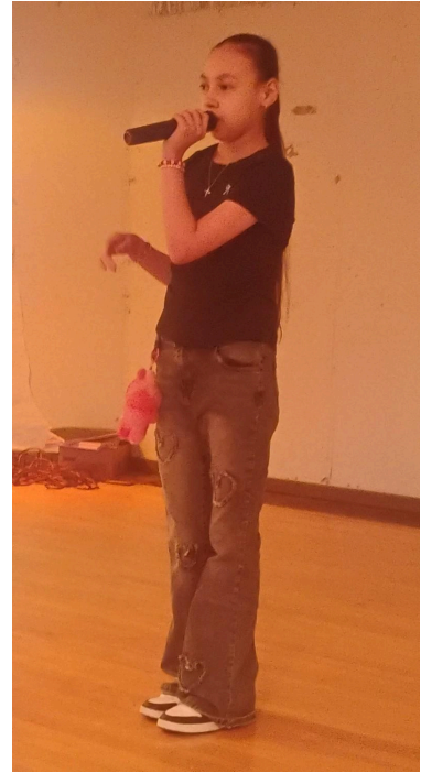
Special Olympics Regionals - January 12, 2026