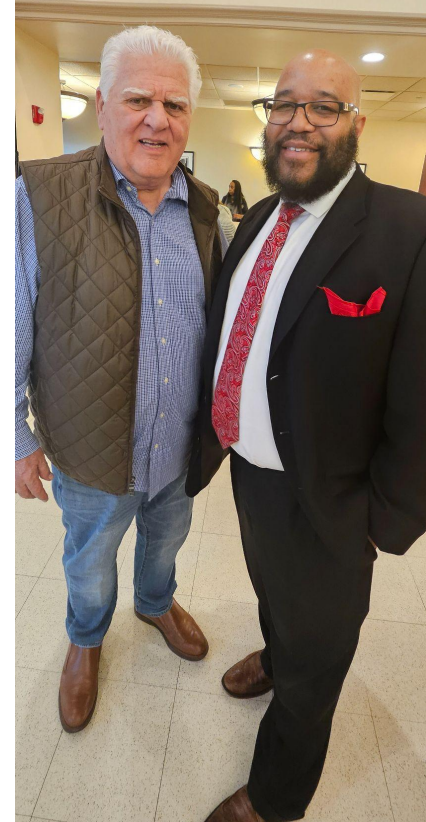
Mayor Serpico-Melrose Park