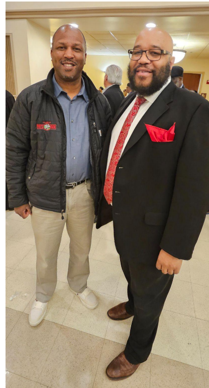
Mayor Hoskins-Forest Park