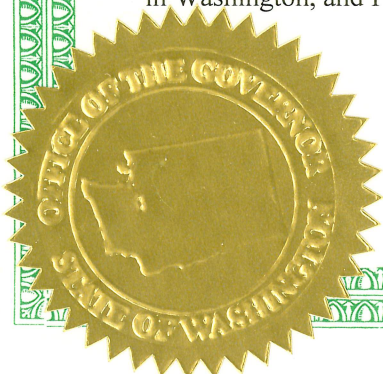
Governor Bob Ferguson

A handwritten signature in blue ink that reads "Bob Ferguson".