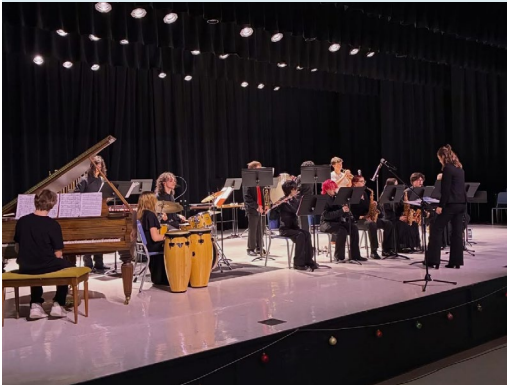
Taft High School students using the newly updated theater!