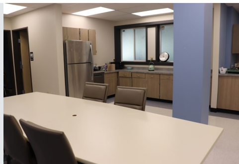
The old cafeteria stage at Sam Case Elementary was repurposed into a care room and office space (pictured above).