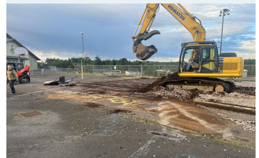
Crews prepare for a new turf play field installation at Crestview Elementary.