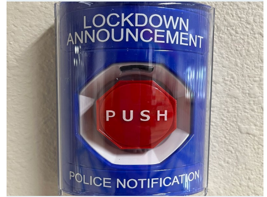
The 2025 Bond has funded the installation of Blue Button Safety Systems district-wide.