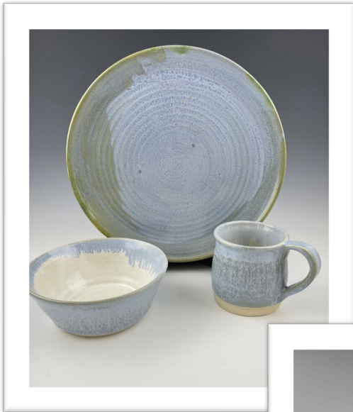
Kaia Lass - Grade 12 Ceramics