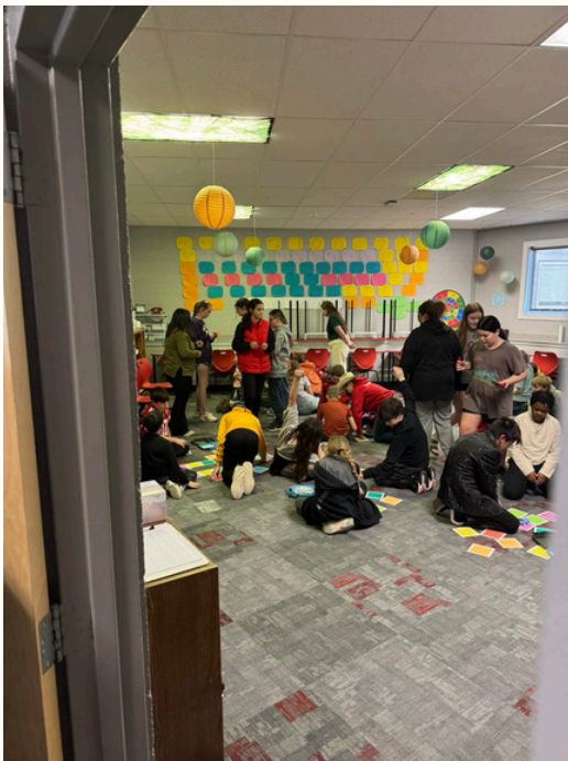
Kstate Extension with robots at the CMS Science Fair