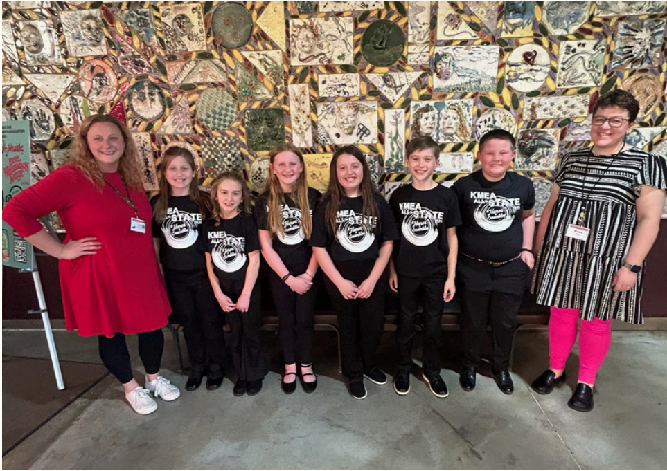
All-State Elementary Honor Choir