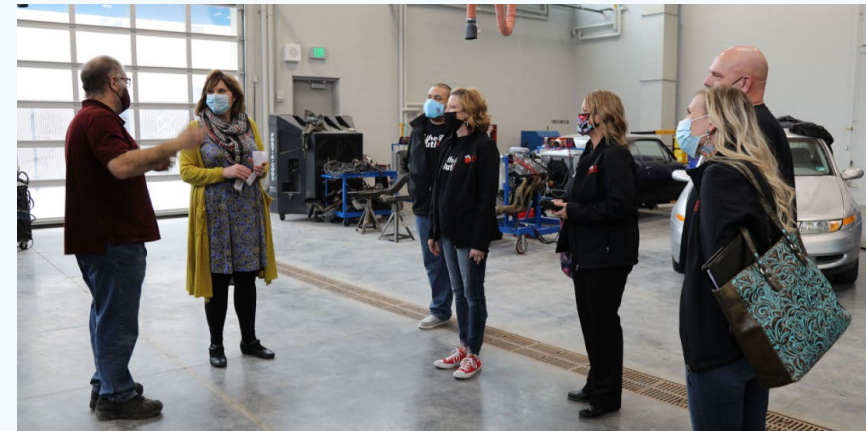
Listening to the instructor of the automotive class. They have 4 car lifts and change oil, tires, headlights, and do small repairs.