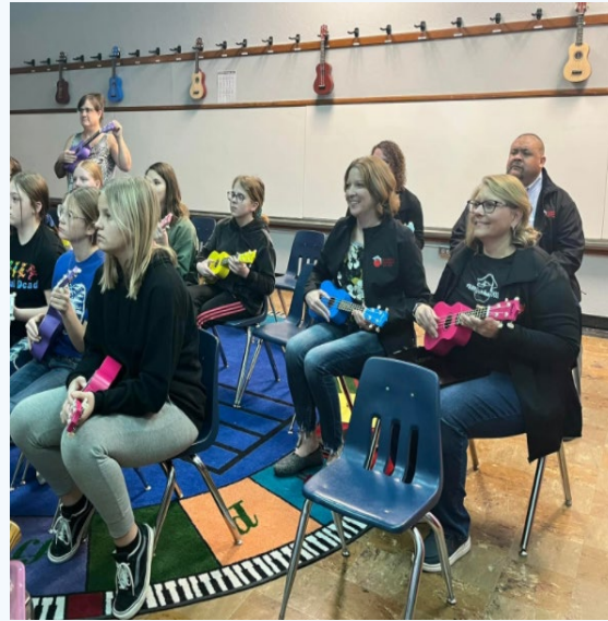
Playing ukuleles with 7 th and 8 th grade music class