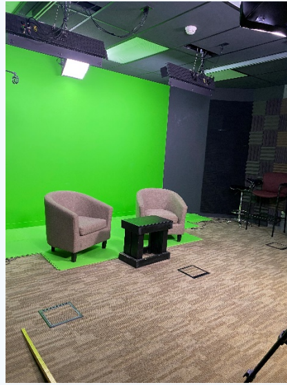
Green Room they use for their media productions