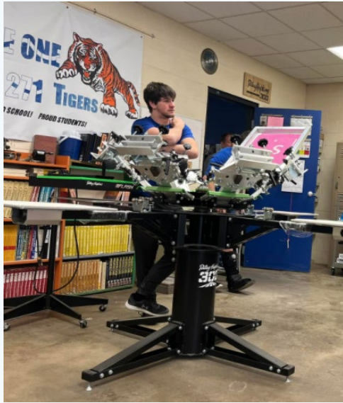
Screen printing machine