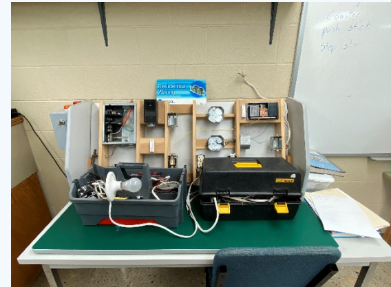
Electrical Station to teach basic electrical skills