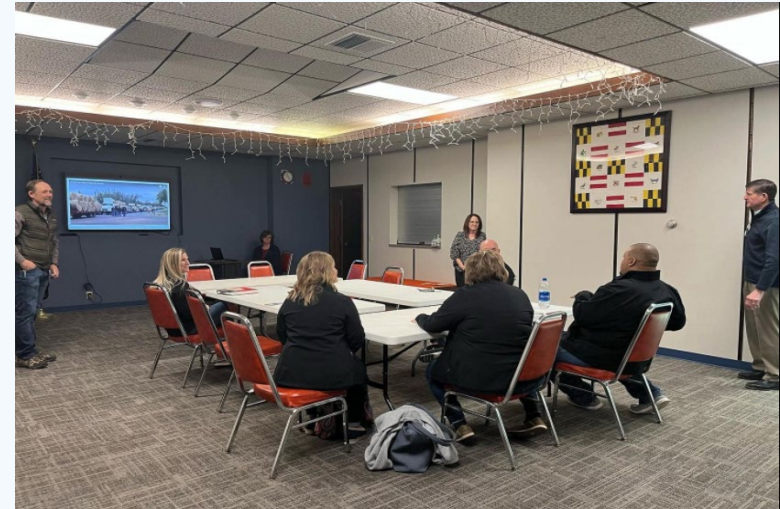
Learning about the fires in Ashland, and the tremendous amount of support they received from across America.