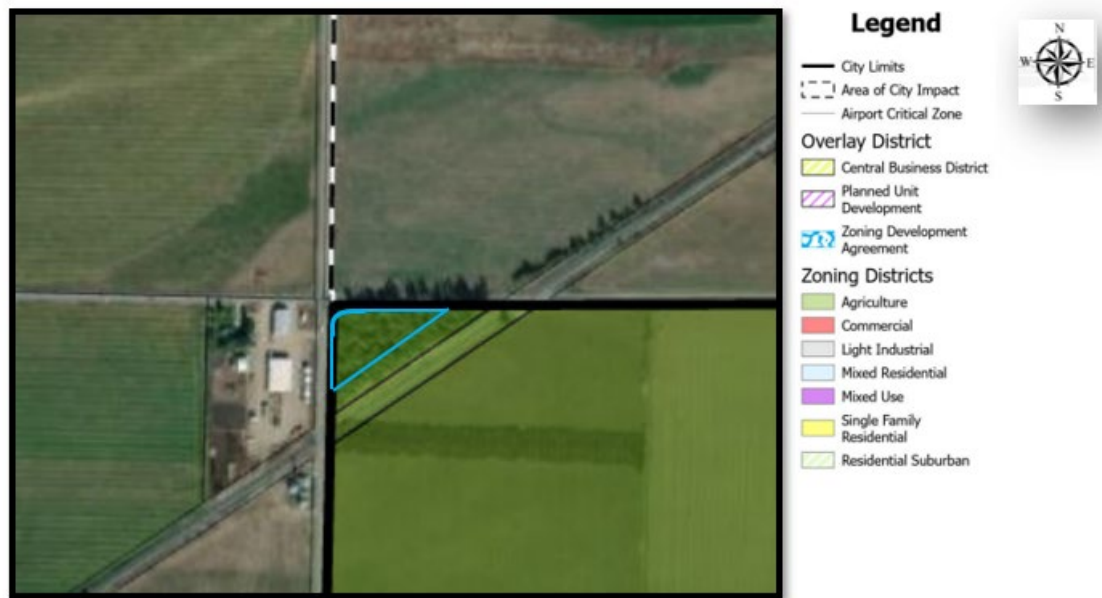
City of Hayden Current Zone Map

Agriculture (A): The Agriculture zone provides for activity which generally occurs on the outskirts of Hayden, where large, undeveloped lots are primarily used for farming and agricultural pursuits as defined herein.