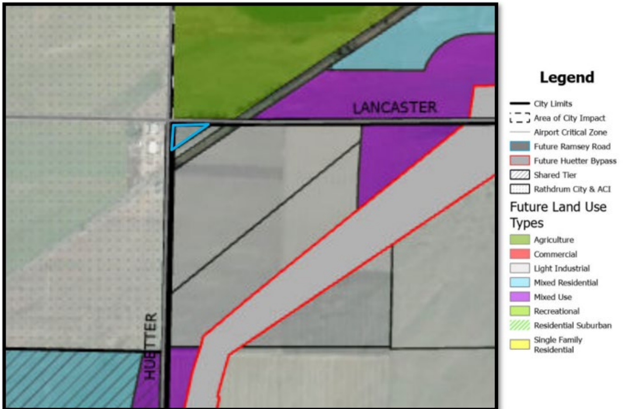
City of Hayden Future Land Use Map

Based on the applicant’s proposal, Staff does not believe additional conditions are necessary.