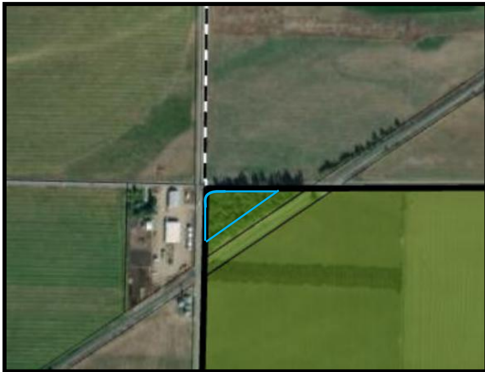
City of Hayden Current Zone Map