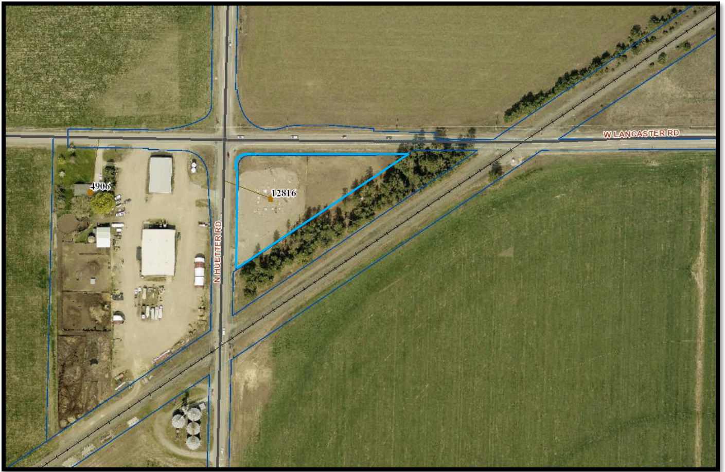
Aerial Imagery from Kootenai County GIS Mapping Tool