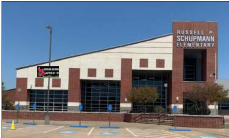
Proposed Location 2