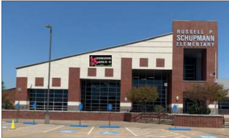
Proposed Location 1