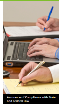
Assurance of Compliance with State and Federal Law

As part of the Assurance of Compliance, each district must verify that there is a copy of these laws in all buildings in the district.