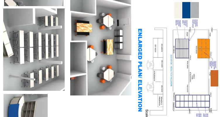
ENLARGED PLAN / ELEVATION