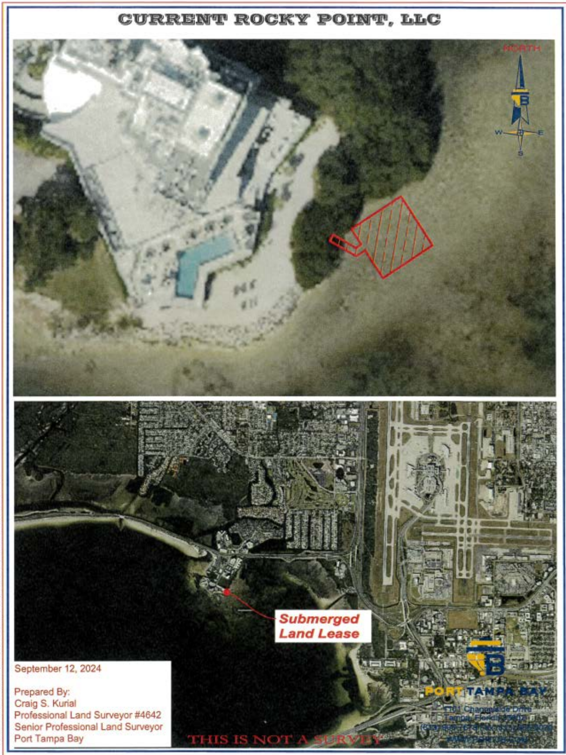
EXHIBIT NO. 1 DEPICTION AND LAYOUT OF THE PREMISES

TAMPA PORT AUTHORITY PUBLIC HEARING Current Rocky Point, LLC – Submerged Lands Lease November 7, 2024 @ 2:00 p.m. PTB ID# 441788