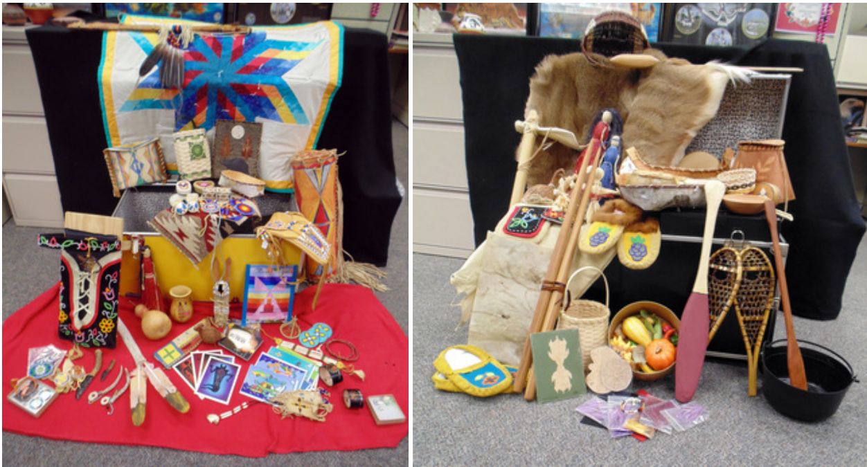
Some examples of school learning trunks.

SERVING REMER, LONGVILLE, BOY RIVER, FEDERAL DAM, OUTING AREAS EVERY PERSON A LEARNER, EVERY LEARNER SUCCESSFUL; TOGETHER WE CONTROL SUCCESS.