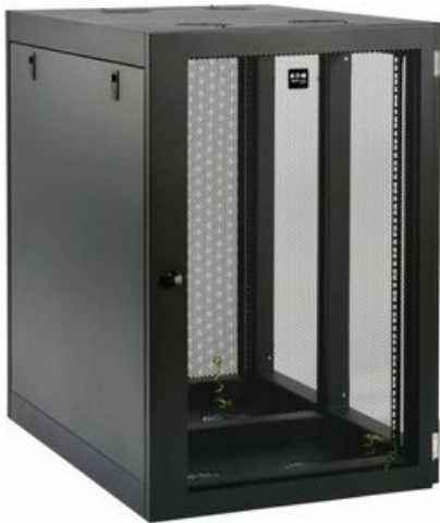
Tripp Lite series (Code: SRW18UHD)