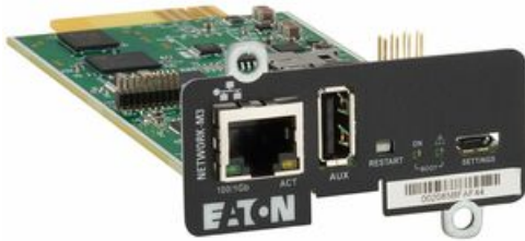
Eaton (Code: NETWORK-M3)