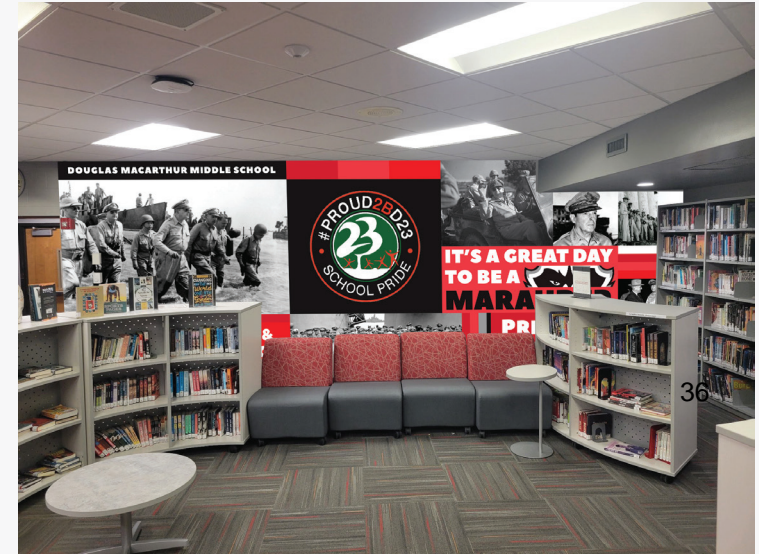
*Mockup on photo is just for visual purposes - may not be exact scale, or exact to installation*