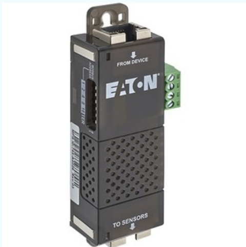
Eaton (Code: EMPDT1H1C2)