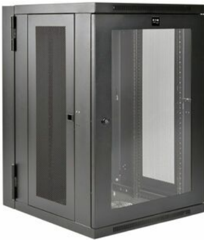
Tripp Lite series (Code: SRW18USDPG)