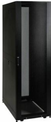
Tripp Lite series (Code: SR42UB)