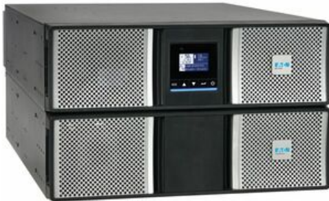
Eaton (Code: 9PX6KTF5G2)