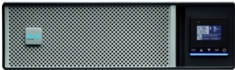
Eaton (Code: 5PX2000RT3UNG2)