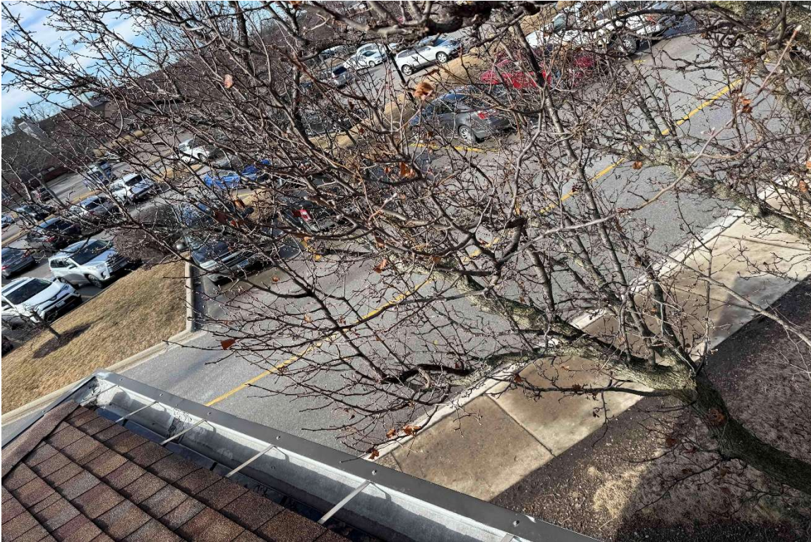
Rodent access point due to overgrown trees.