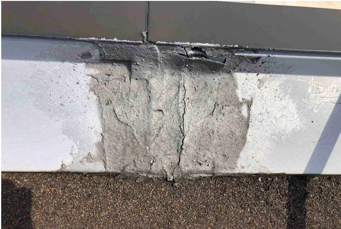
Splits located at existing gutter repairs.