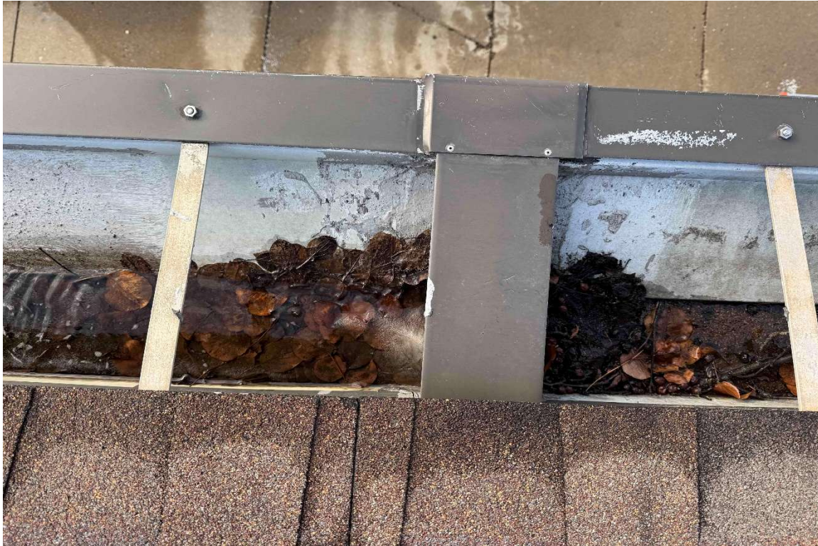
Typical leaves and ponding water in gutter.