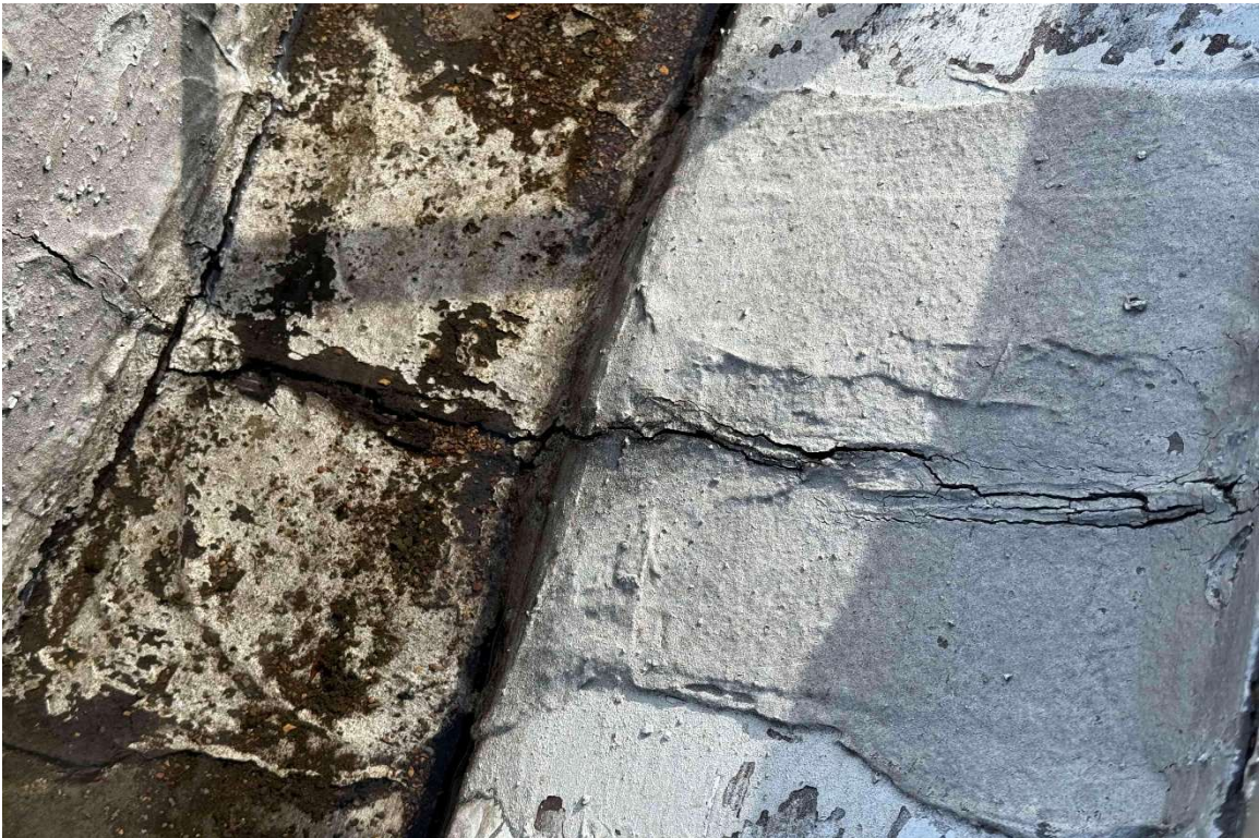
Splits located at existing gutter repairs.