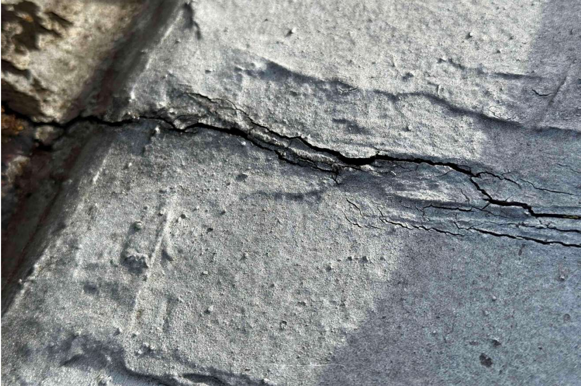
Splits located at existing gutter repairs.