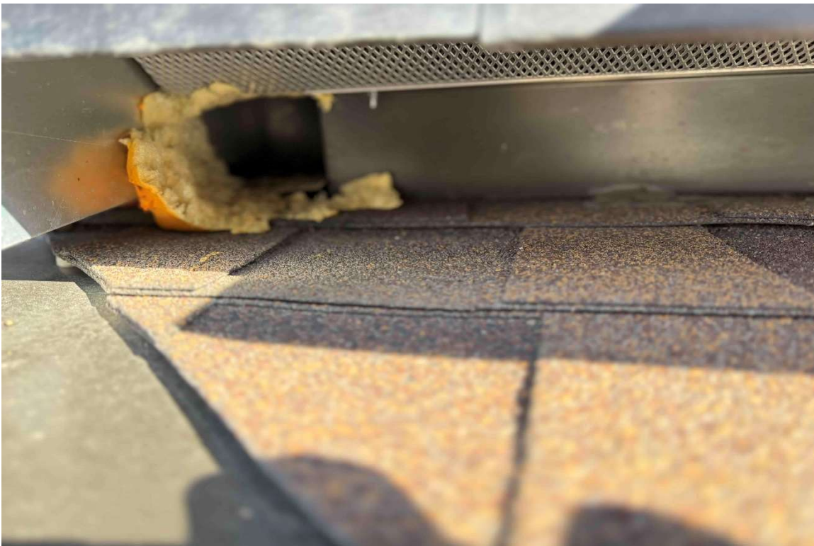
Rodent entry point at open roof vent.