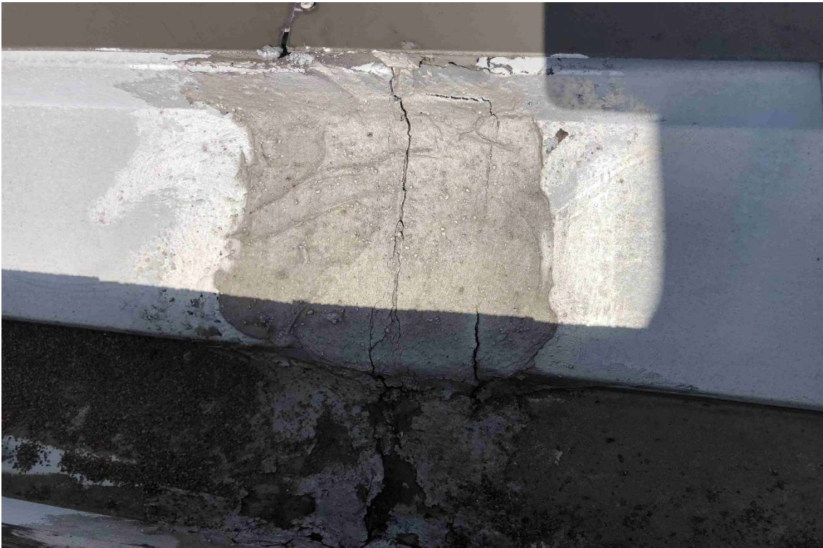
Splits located at existing gutter repairs.