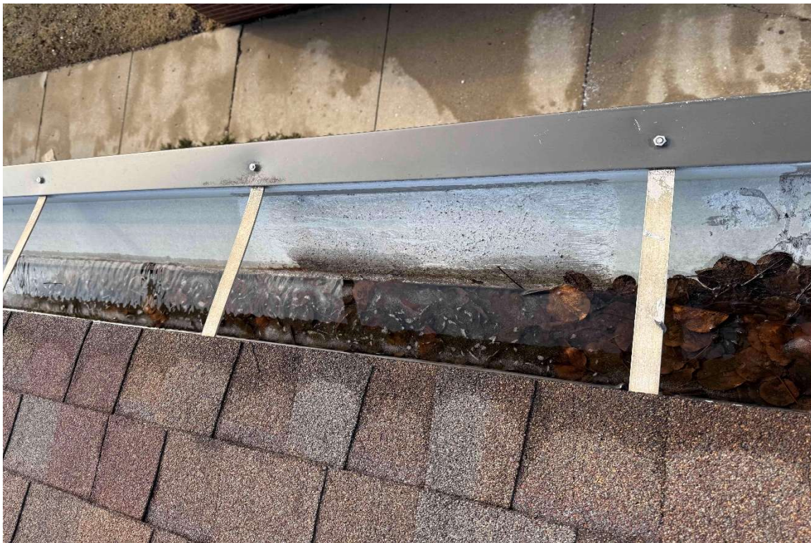
Typical leaves and ponding water in gutter.