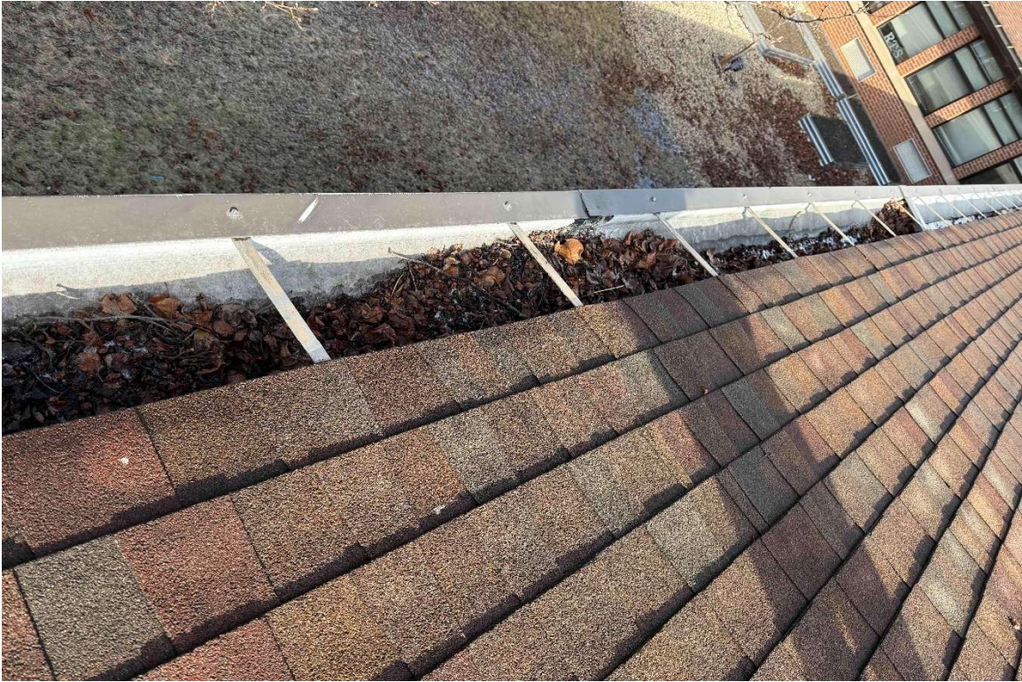
Typical leaves and ponding water in gutter.