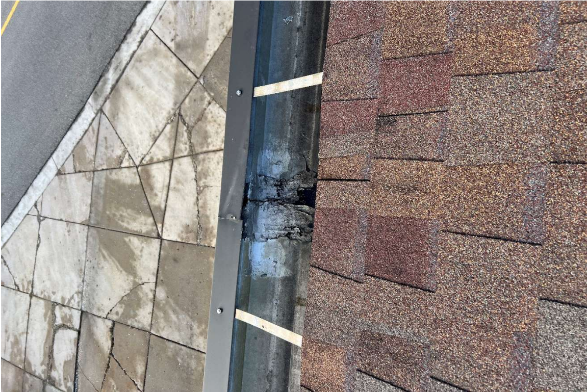
Splits located at existing gutter repairs.