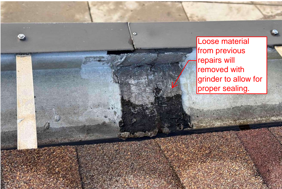
Splits located at existing gutter repairs.