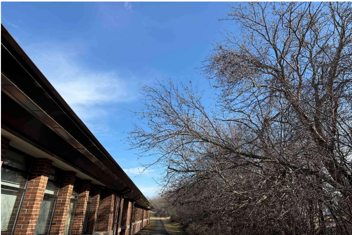
Rodent access point due to overgrown trees.