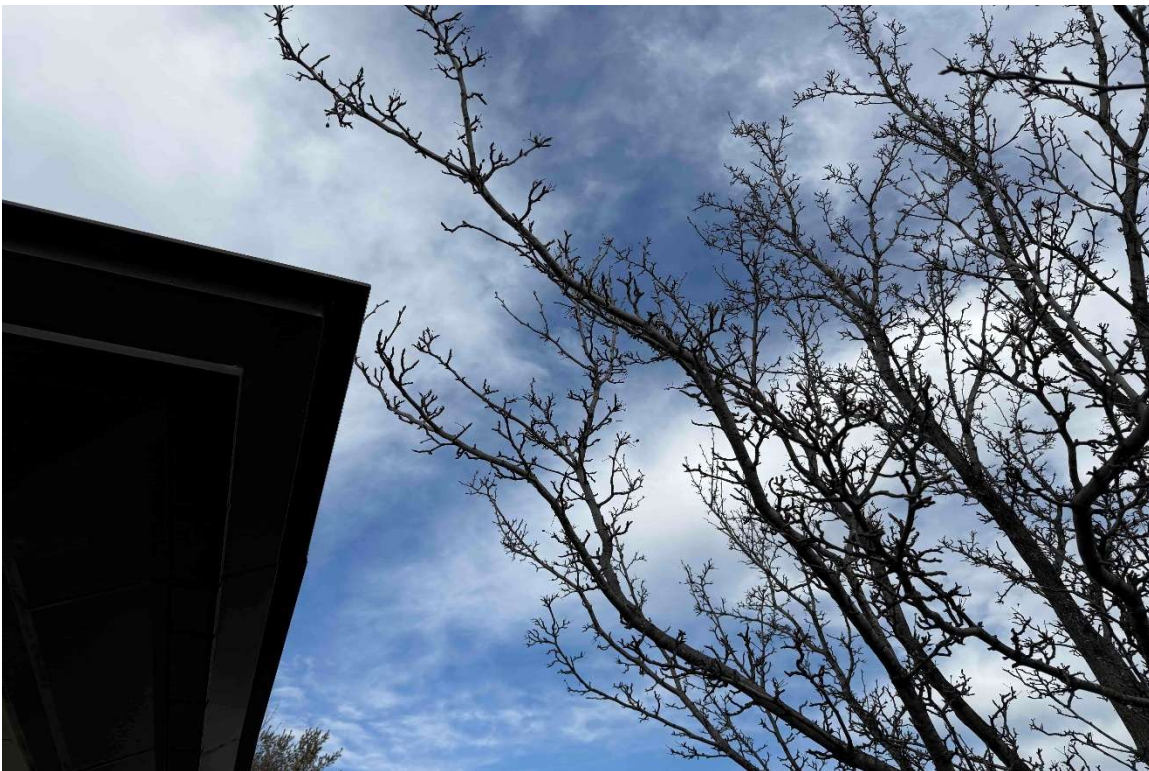
Rodent access point due to overgrown trees.