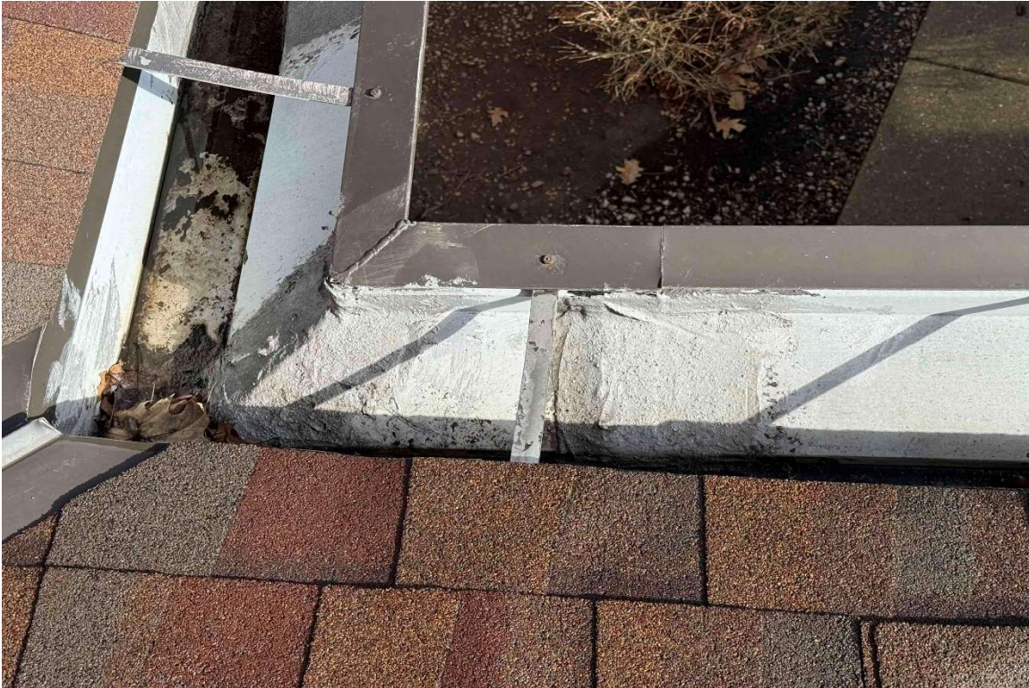
Splits located at existing gutter repairs.