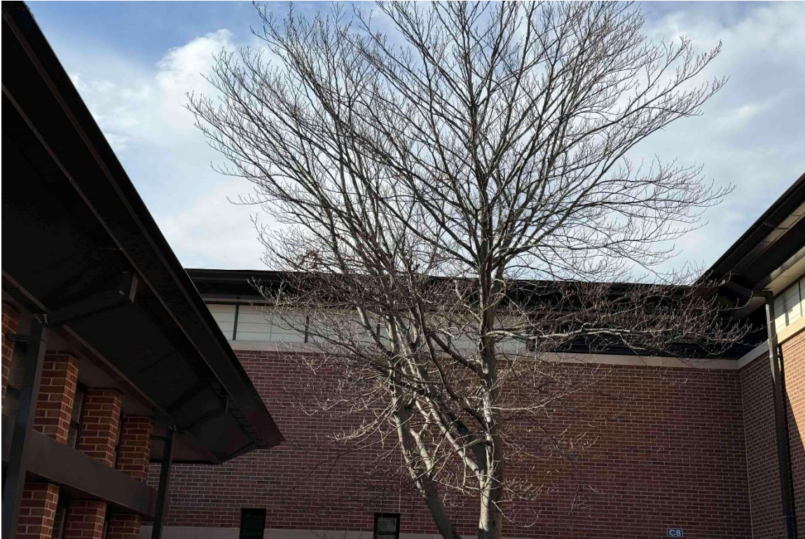
Rodent access point due to overgrown trees.