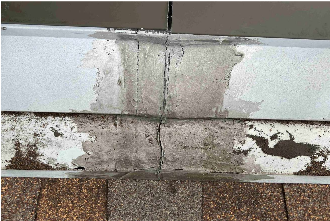
Splits located at existing gutter repairs.