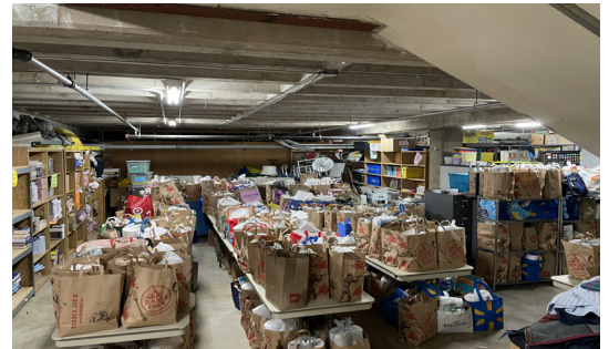
Donations of food at Valley View Elementary

Columbia Heights Public Schools serves Columbia Heights, Hilltop and Southern Fridley. The entire district, approximately 3 ½ square miles, experienced the heavy and oppressive presence of immigration agents during the surge. While the presence and threat have eased up since mid-February, its ripple effects will be long-lasting.