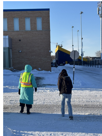
Community Safety Patrols at Columbia Heights High School