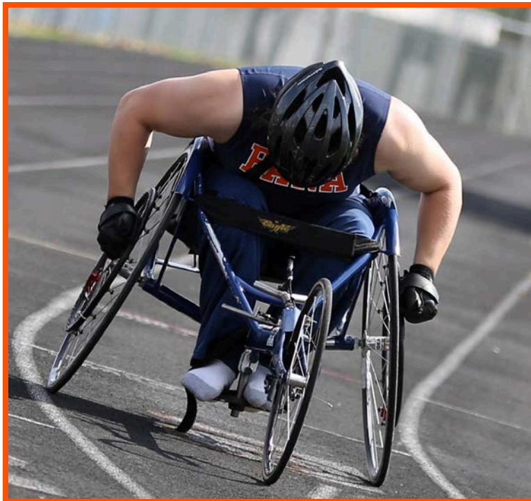
State Champion & State Record Holder!