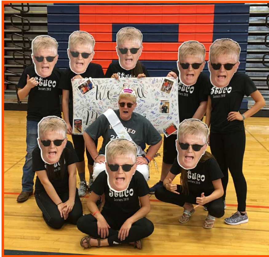
Love these seniors!