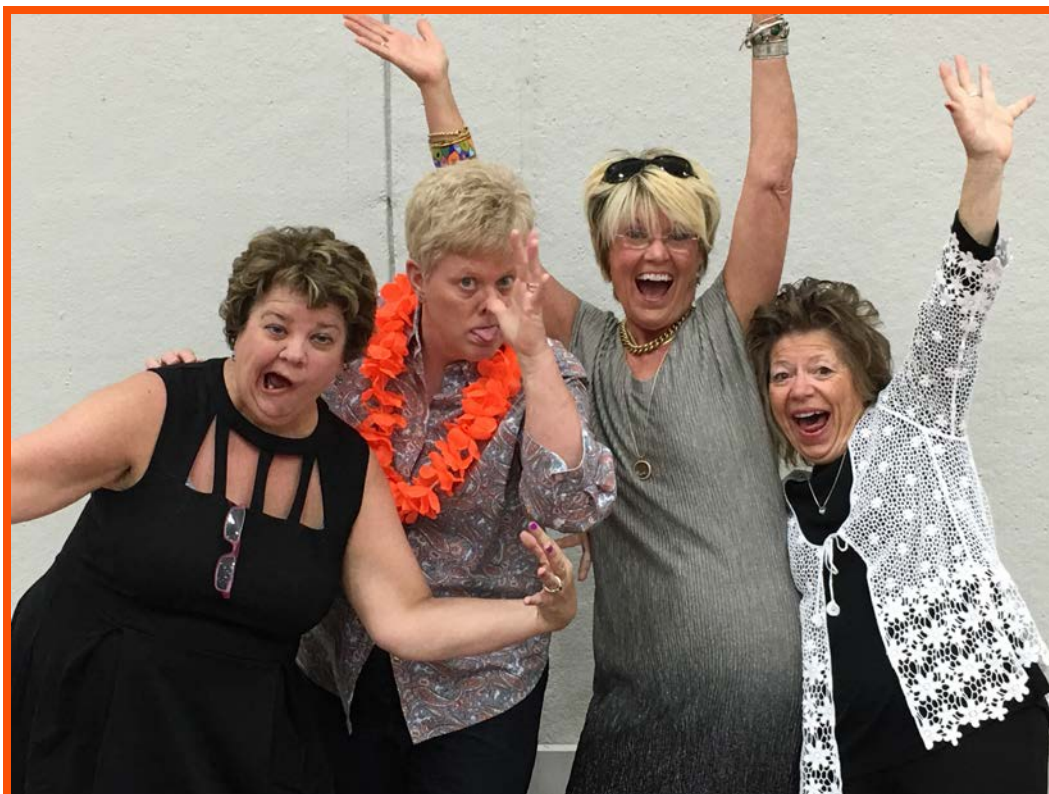
Stick a fork in us – we're done!