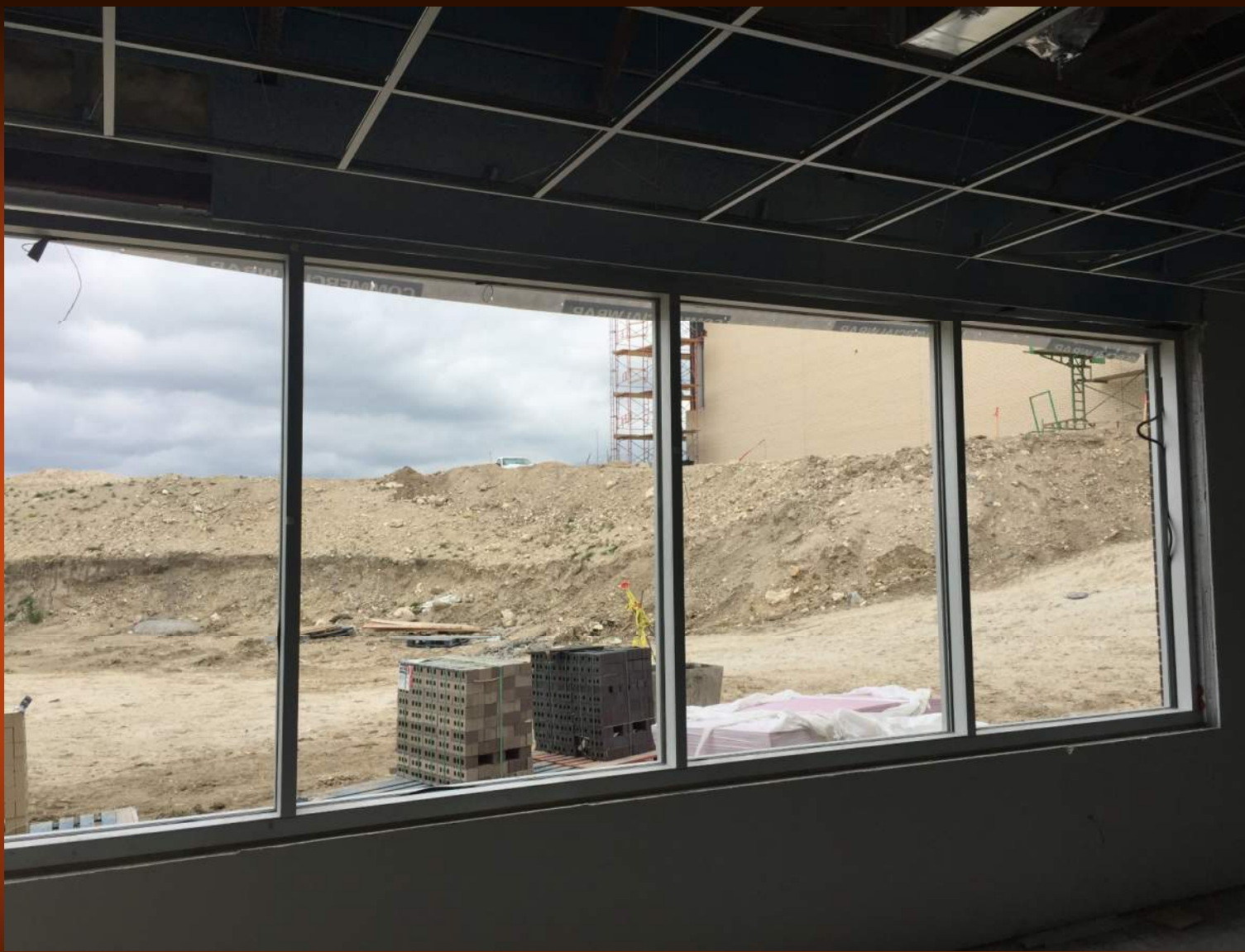
Walsh Elementary Exterior Aluminum Window Frames