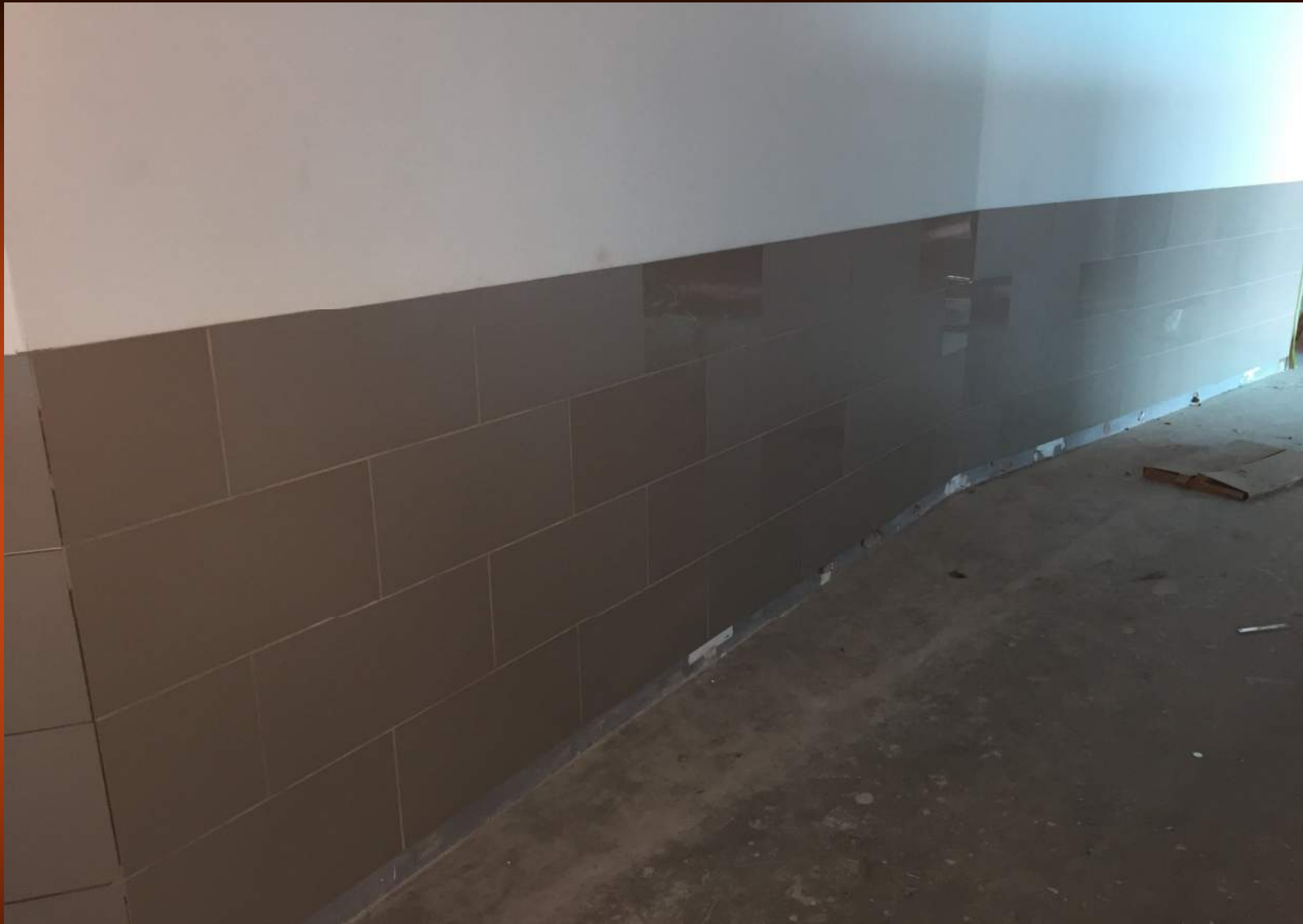
Walsh Elementary Area A – Corridor Wall Tile