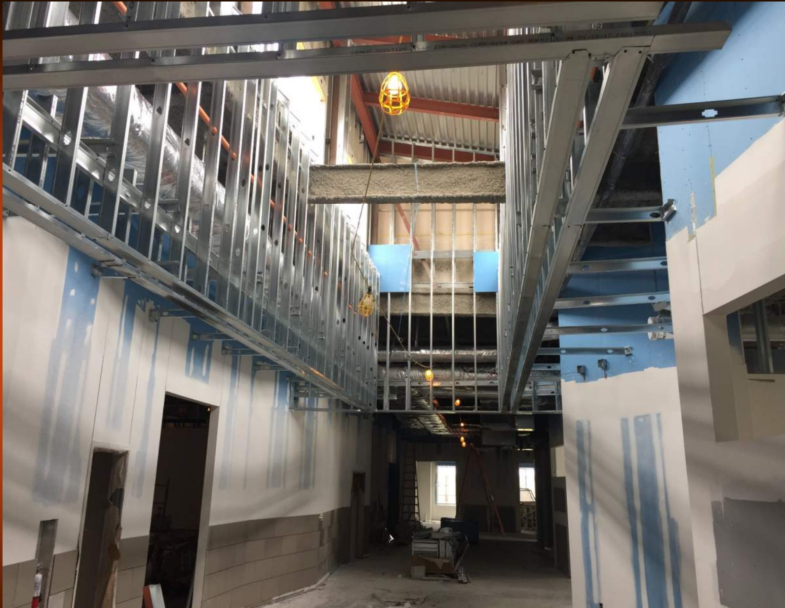
Walsh Elementary Area A – Interior Framing at Clearstory