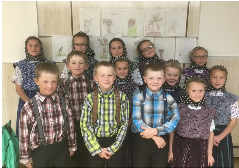
Directed Drawing Project with a Fall Theme