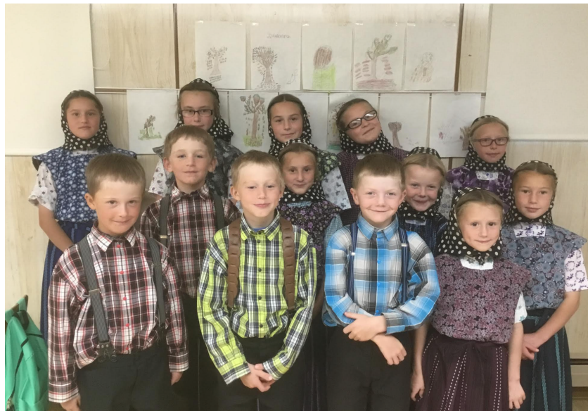
Directed Drawing Project with a Fall Theme