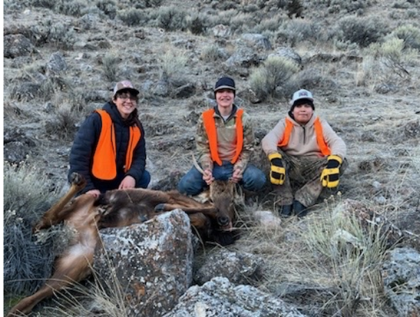
BHA students on a Yellowstone hunting trip – March 2024.