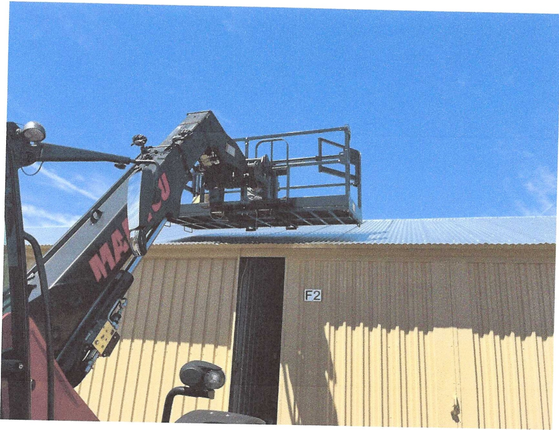
Fix 2 holes where water was dripping into Hangar