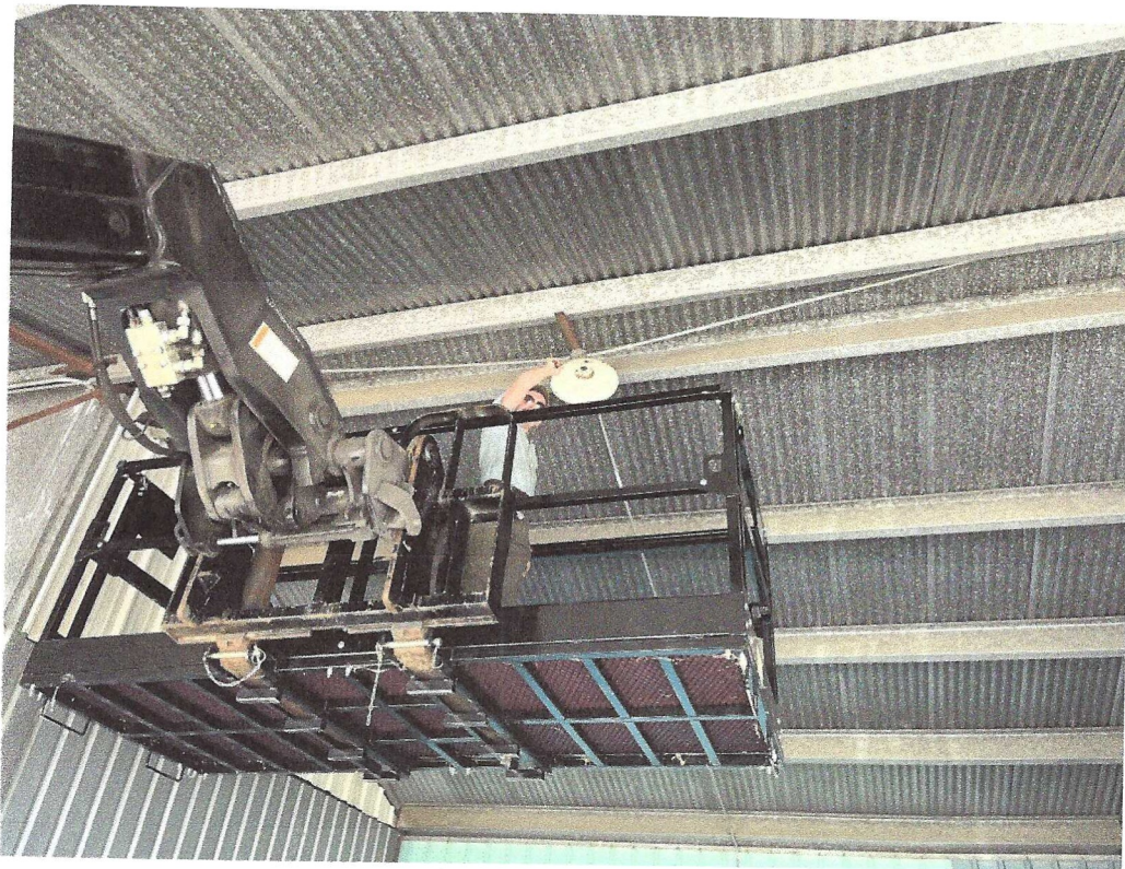
Removal of rusty light fixtures!