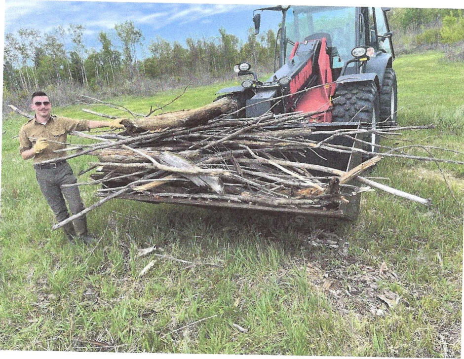
Clean up Sticks on 10 acres north of Seaman Road