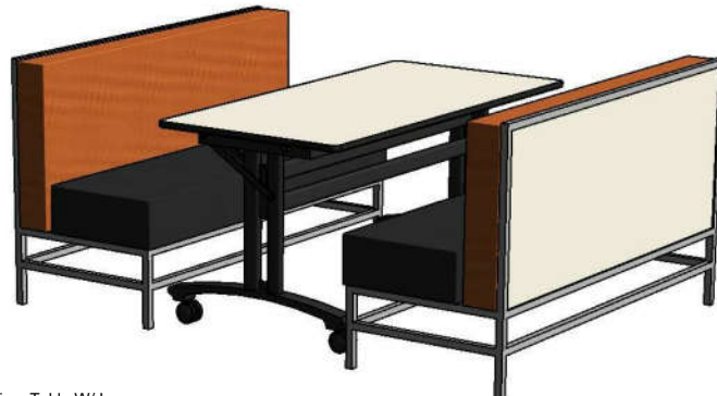
Ogden Booth, Upholstered W/ MultiApp IIS Table