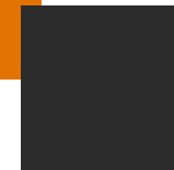
Additional Color/ Material Options Available *Not limited to As Shown