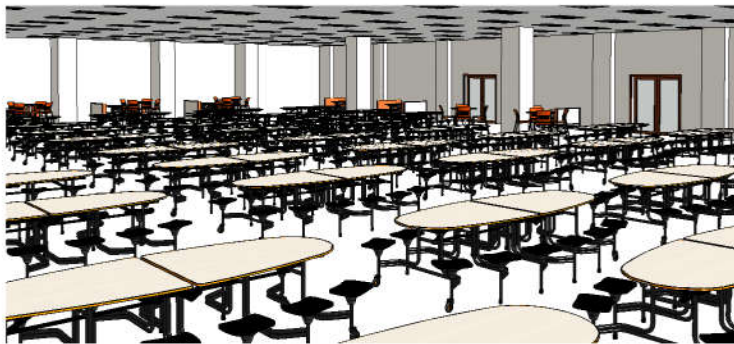
② 3D View 2