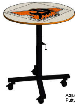
Adjustable height Socializer Table W/ Logo, Putty Laminate