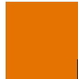
Stool, Accent Guard, Caster Cover, Armor Edge Colors- Orange Zest, Black