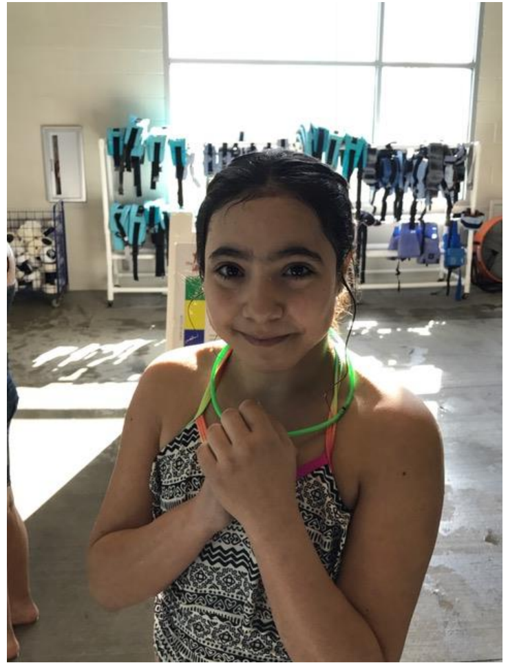
Boise Field Trip (Zoo, MK Center, Discovery Center) for 7 th grade