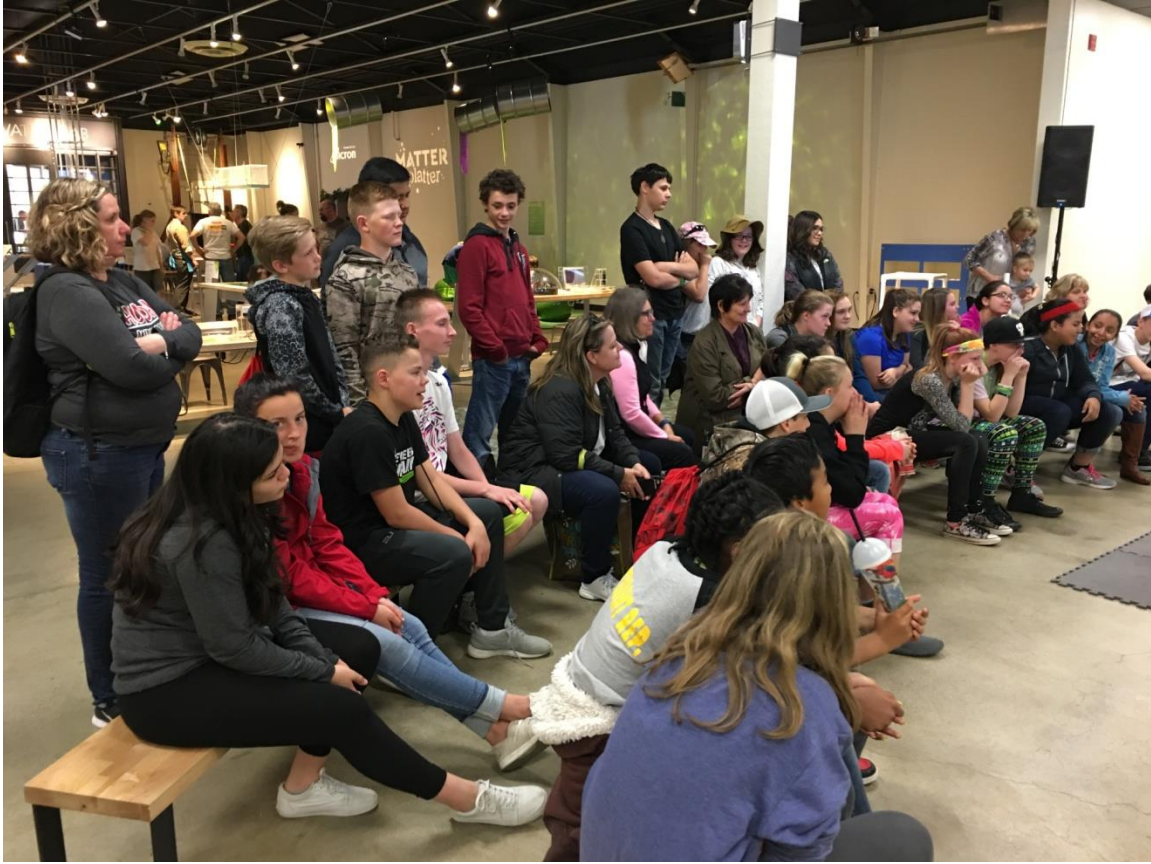
Eighth Grade Registration for High School