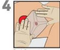
Firmly Press onto skin