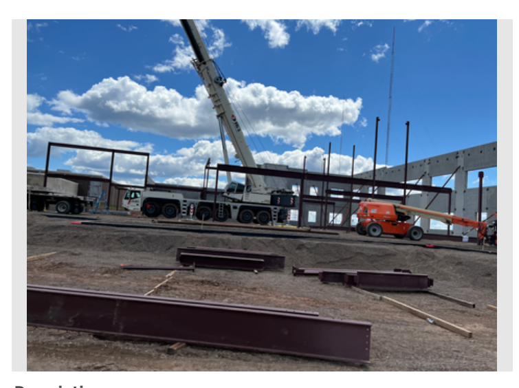
Description Precast and Steel DSC Progress

Job #: S20120C DSC & Transportation - Duluth Schools 730 E Central Entrance Duluth, Minnesota 55811