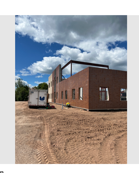
Description DSC Precast