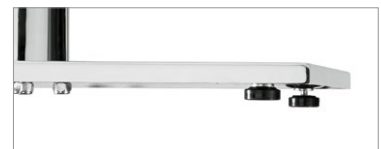
Leveling glides standard on all bases