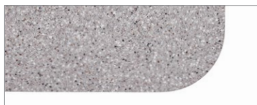
3" radius corners are available on solid surface (shown), high pressure laminate and thermally fused laminate tops