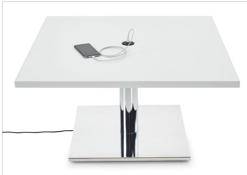
Power management in select columns