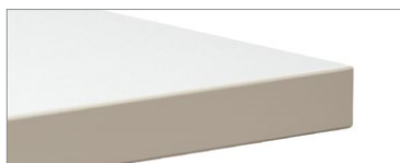
Thermally fused laminate top with contrasting flat edge - Latte shown