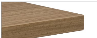
High pressure laminate top with matching flat edge