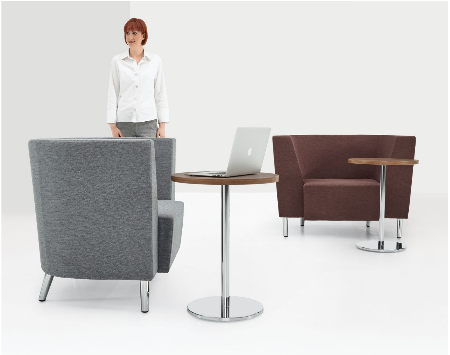
Table for one, please

Swap laptop tables provide enough surface space for a laptop, tablet or a coffee and croissant. Square base models are available with an offset column for extra legroom. The 25.6" height puts everything at the right height for lounge seating applications.