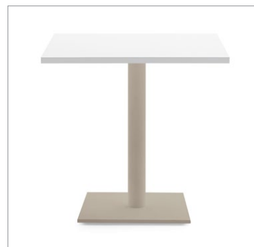
A wide selection of painted finishes available