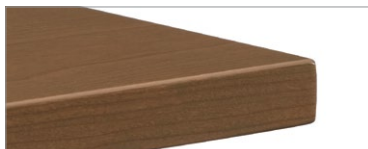
Veneer top with solid hardwood flat edge