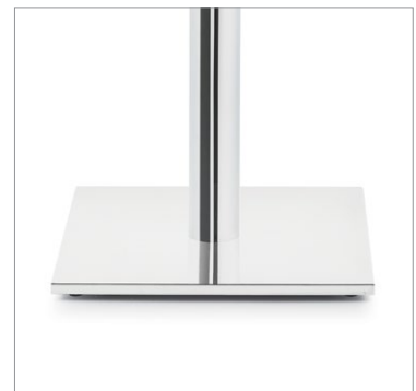
1/2" thick steel square and round metal bases