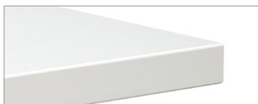
Thermally fused laminate top with matching flat edge