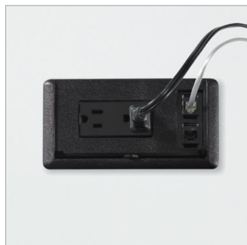
Optional power and data modules on select sizes