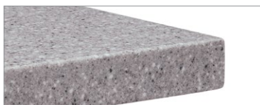
Solid surface top with flat edge