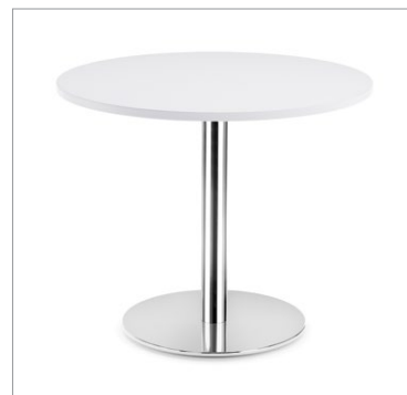
Four plated finishes available