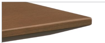
Veneer top with solid hardwood knife edge