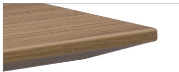
High pressure laminate top with matching knife edge