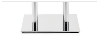
A dual column base is available for select tops