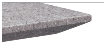
Solid surface top with knife edge