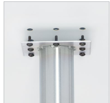
Factory installed metal inserts for easy metal-to-metal base connection