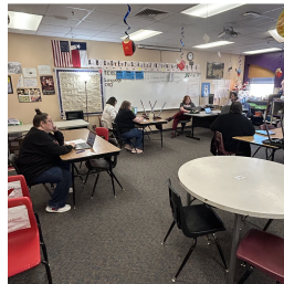
Reading PLC Meeting