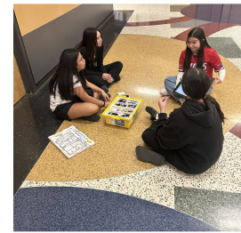
After School E-Sports