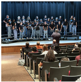
Fall Choir Concert