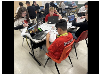
Honors Science Class