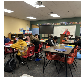
5th Grade History Class