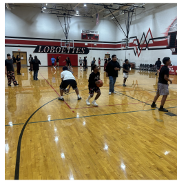
7th Grade Social