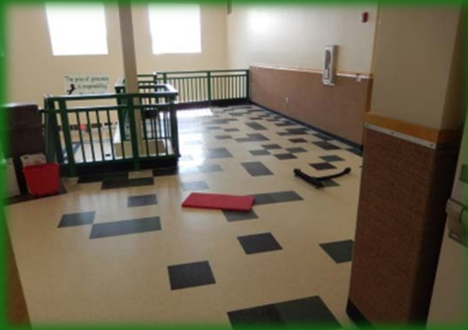
VTC east in front of C-Region