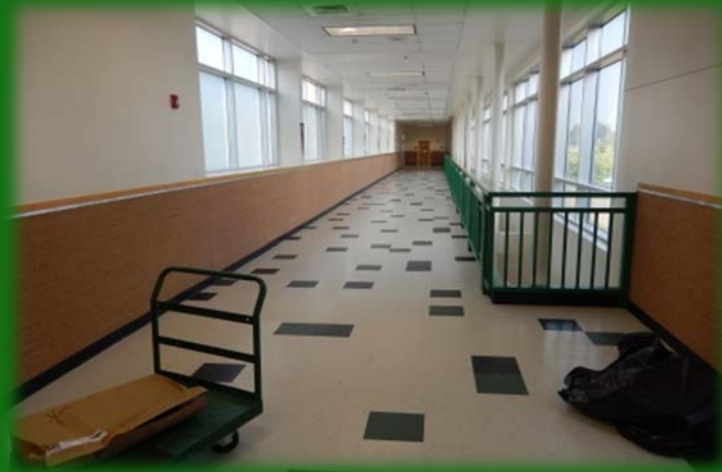
C/D Hallway VTC