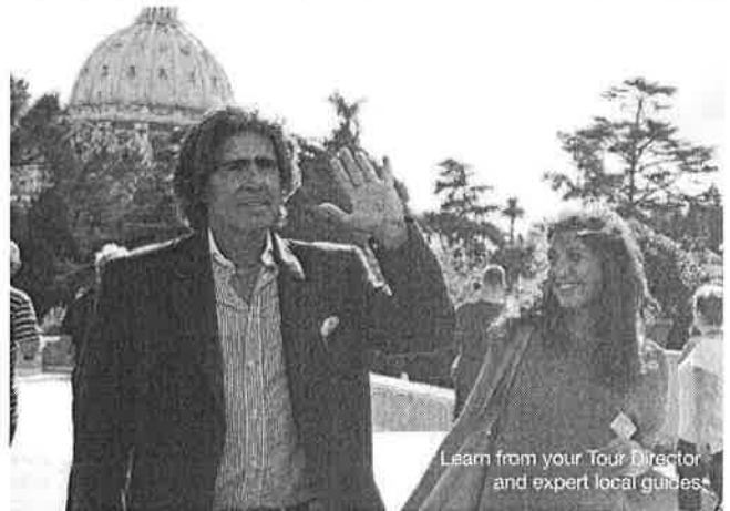
Learn from your Tour Director and expert local guides.