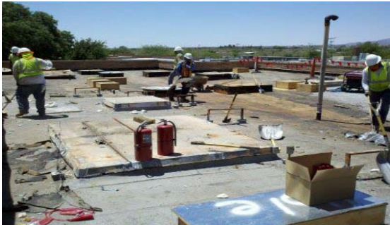
CDO Kitchen Roof Replacement