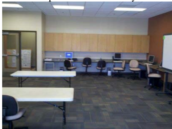
Transportation Driver's Training Room