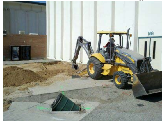
CDO New South Gym Restroom Site Prep