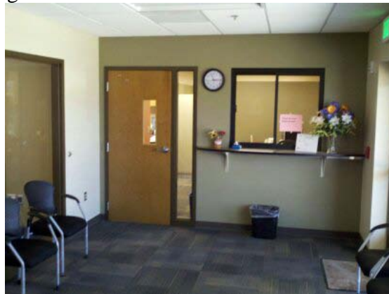
Transportation Main Lobby