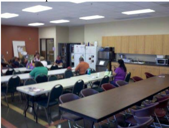
Transportation Driver's Lounge