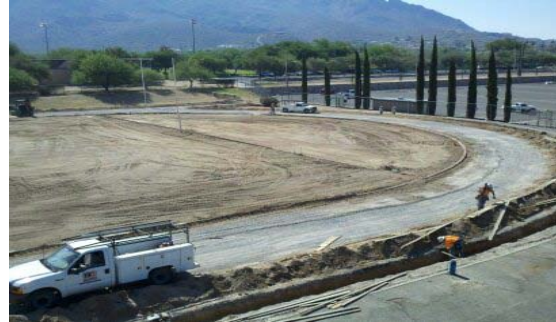
CDO Track Replacement and Field Re-crown

D. Copper Creek Classroom Renovation / IT Re-cabling : Construction is 80% complete. The renovation of classrooms 14 & 15 into computer labs and IDF #1 will be complete this week. All classroom accordion walls have been replaced. All above ceiling backbone cabling is complete. Surface mount raceway installation in classrooms, IDF's #2, #3, and #5 racking, relocation of the phone PBX, and admin re-cabling are in process.