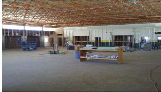
CDO MPR Renovation – North Wall