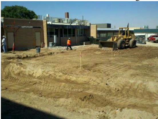
CDO "C" Building Site Prep