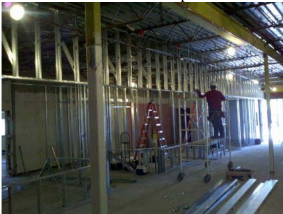
CDO Admin Renovation – framing