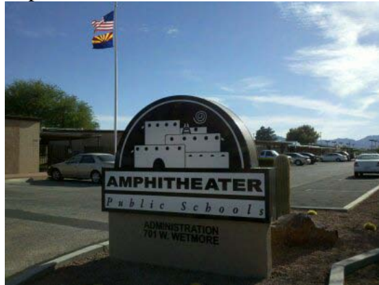
Wetmore New Sign, Flagpole, and Parking Spaces

B. Wetmore Parking Re-capture: Construction is complete.