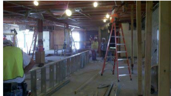
CDO Kitchen Renovation - framing