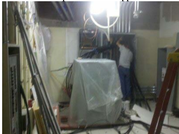
Copper Creek Electrical Upgrades and PBX Relocation