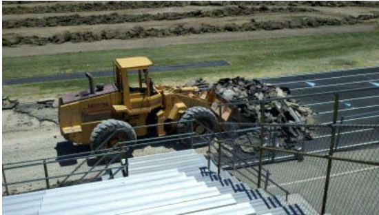
CDO Track Demolition

The stadium repair project is on schedule and on budget.