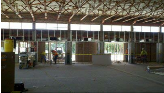
CDO MPR Renovation – West Wall