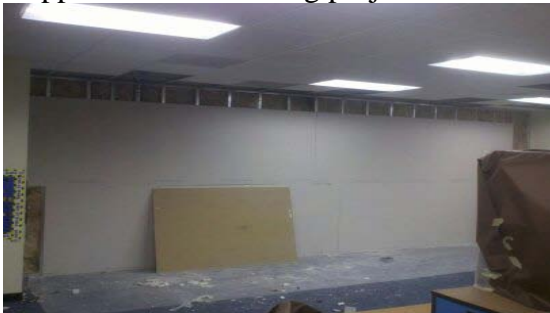
Copper Creek Accordion Wall Replacement

Copper Creek re-cabling project is ahead of schedule and on budget.