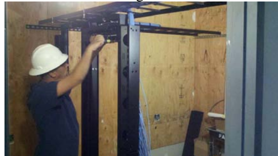
Copper Creek IDF Rack Installation